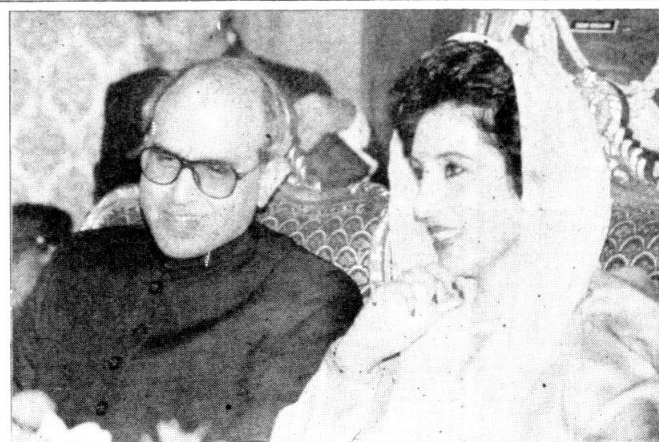
Pakistani Prime Minister Benazir Bhutto chats with newly-elected President Farooq Ahmed Leghari during the swearing-in ceremony in Islamabad yesterday. — AFP Photo

ISLAMABAD, Nov 14: Pakistan's new President Farooq Ahmed Leghari vowed today to strengthen democracy and national cohesion, amid optimism that the new setup augured well for political stability, reports AFP. Speaking to reporters after his induction, Leghari also promised to seek improved relations with the United States. Leghari, 53, a former close lieutenant of Prime Minister Benazir Bhutto, was elected by the 464-member parliamentary electoral college Saturday, with opposition candidate Wasim Sajjad defeated by a 106-vote margin. The victory gave a political boost to Bhutto and lent a considerable degree of stability to her coalition government, politicians and analysts here said. The 53-year-old Oxford graduate, Sunni Muslim and big landlord from the key province of Punjab, is widely respected for his moderate views and clean political record. "The dangers of destabilising democracy are over," Leghari said in his first comments after he was administered the oath by Chief Justice Nasim Hasan Shah. The ceremony was attended by Bhutto, chiefs of the Army, Navy and Air Force, opposition members and Sajjad, who has reverted to his previous post of chairman of Senate after serving as Acting President for nearly four months. Leghari said he would keep the presidency aloof from party politics and play his constitutional role for consolidation of equitable democratic system. He is expected to help Bhutto amend the Constitution. — AFP Photo