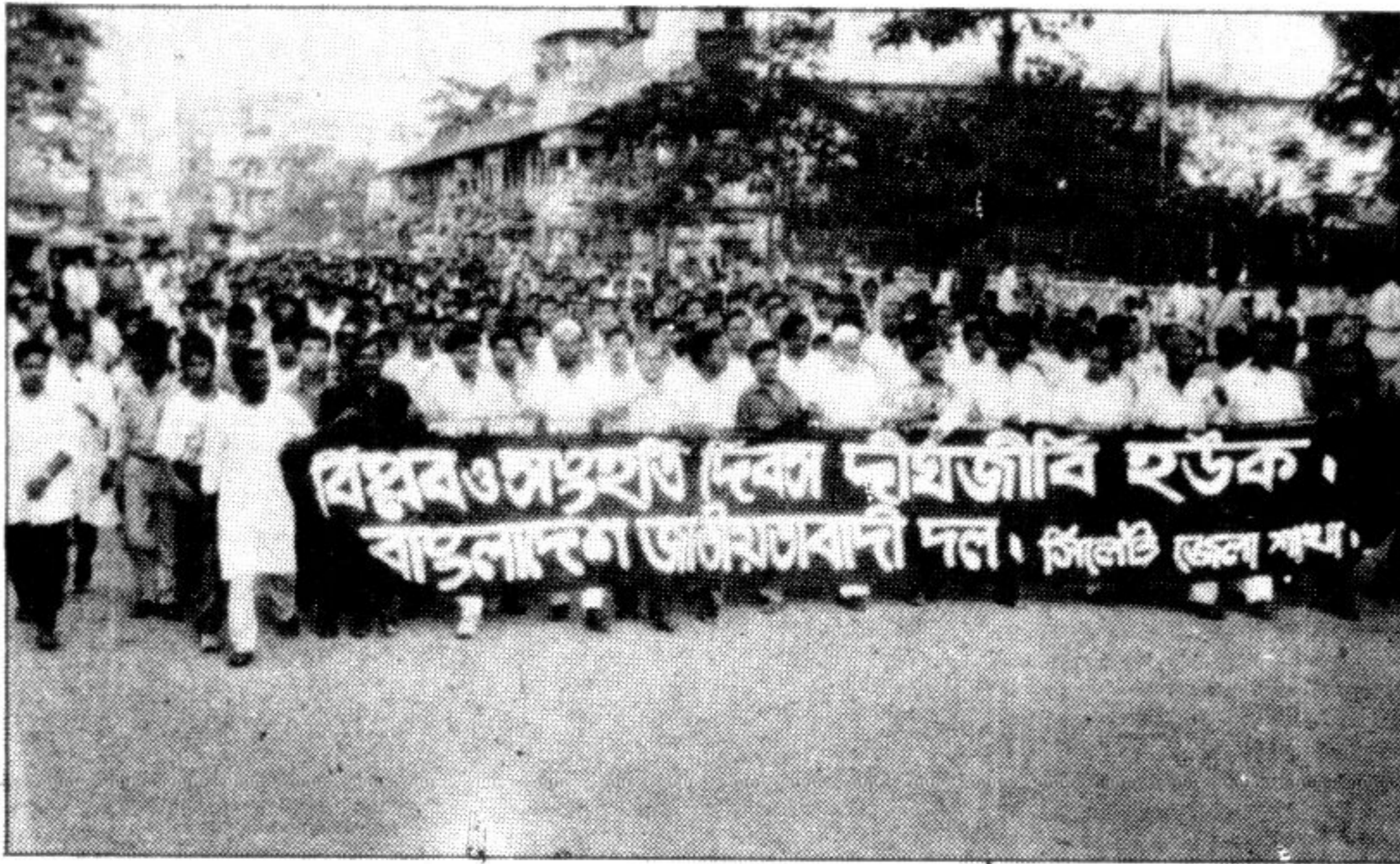
SYLHET: The local unit of BNP brought out a procession here in observance of the National Revolution and Solidarity Day.