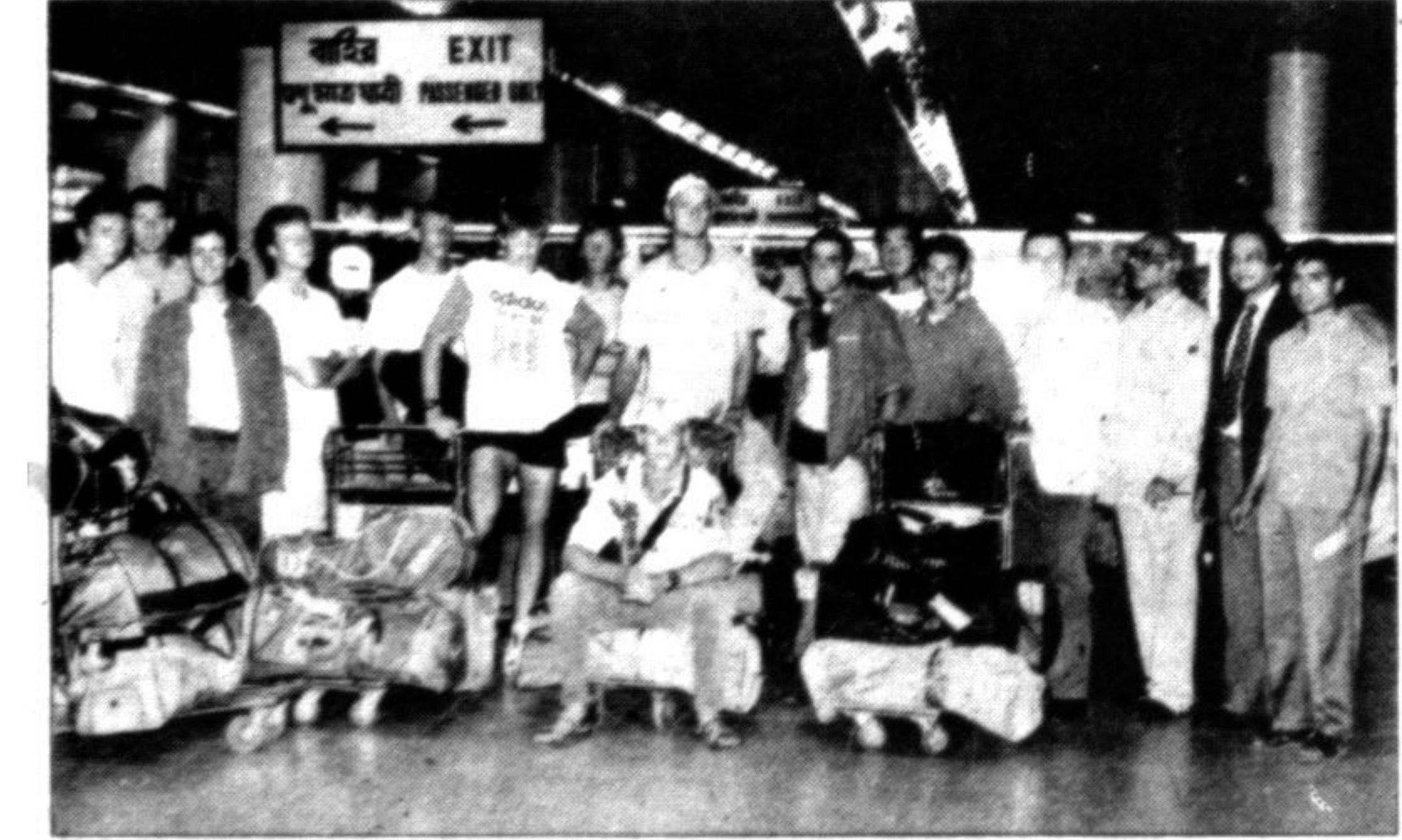
Participants from abroad, who arrived here yesterday to take part in the Gold Leaf ITF Thailand-Bangladesh Satellite Circuit tennis tournament in Dhaka are seen at ZIA.