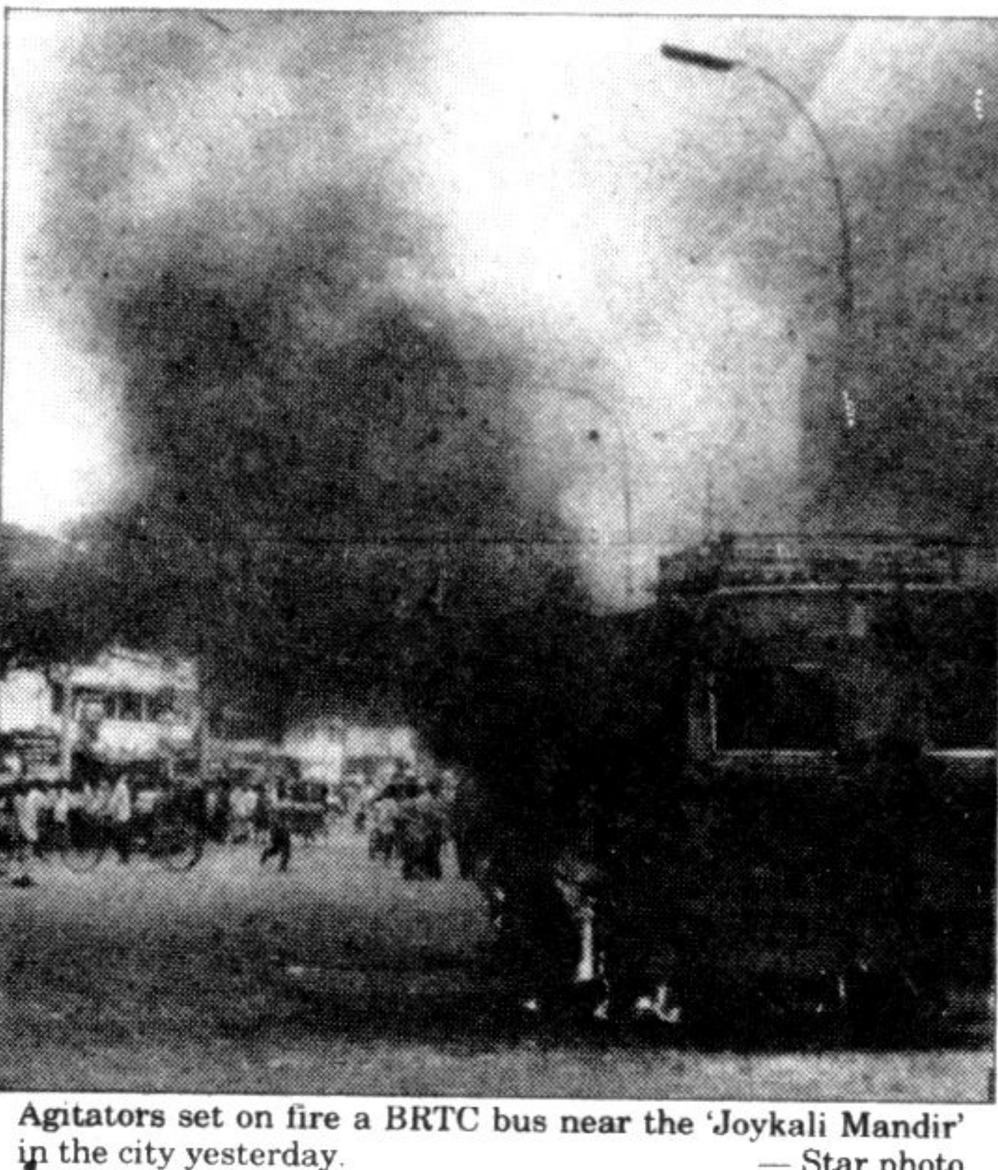
Agitators set on fire a BRTC bus near the 'Joykali Mandir' in the city yesterday.

The JP will observe an additional half-day hartal at the former Upazila headquarters on November 23.