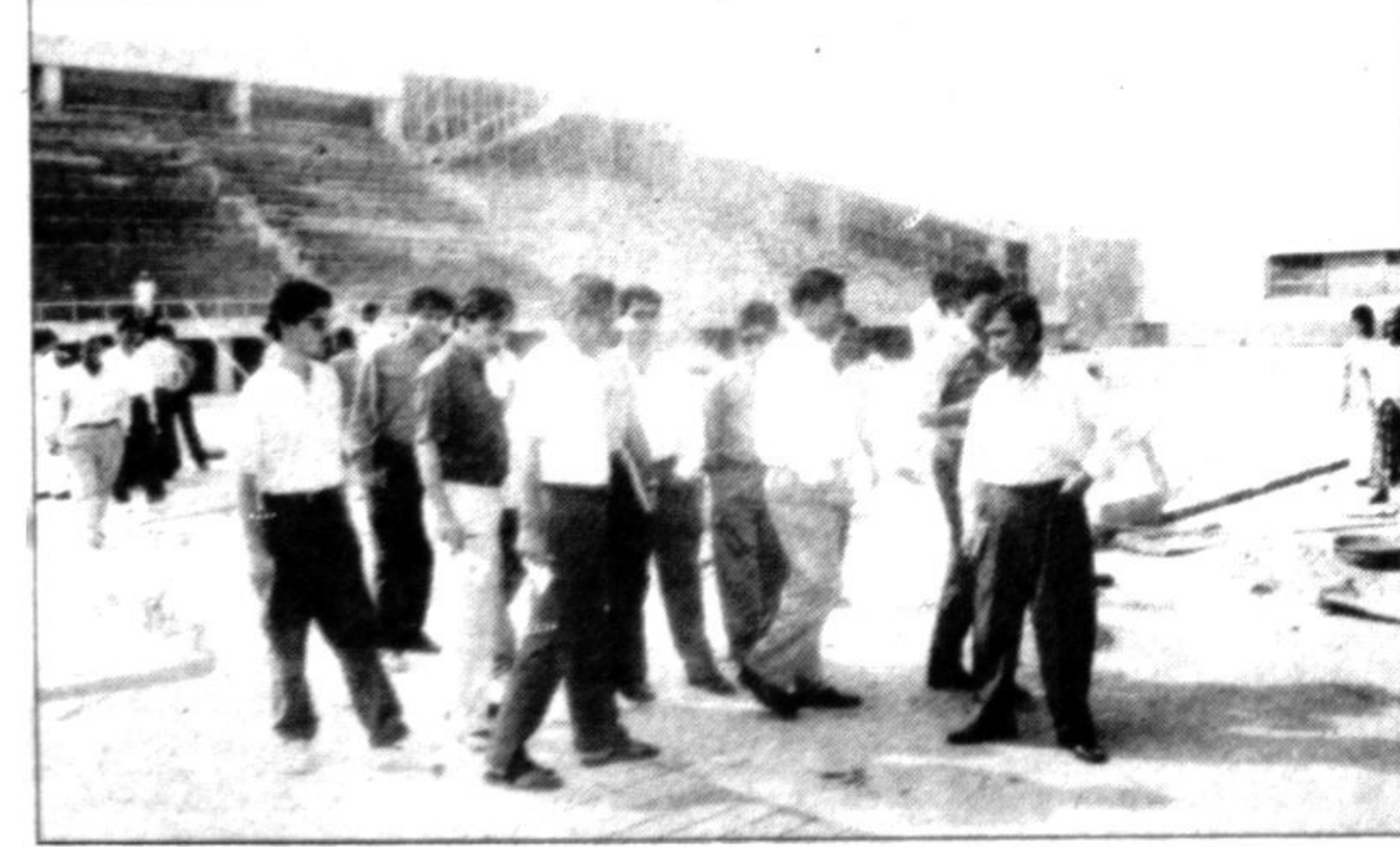
Newsmen inspecting an under-construction swimming pool at Mirpur yesterday. The complex will be used during next month's sixth SAF Games in Dhaka.