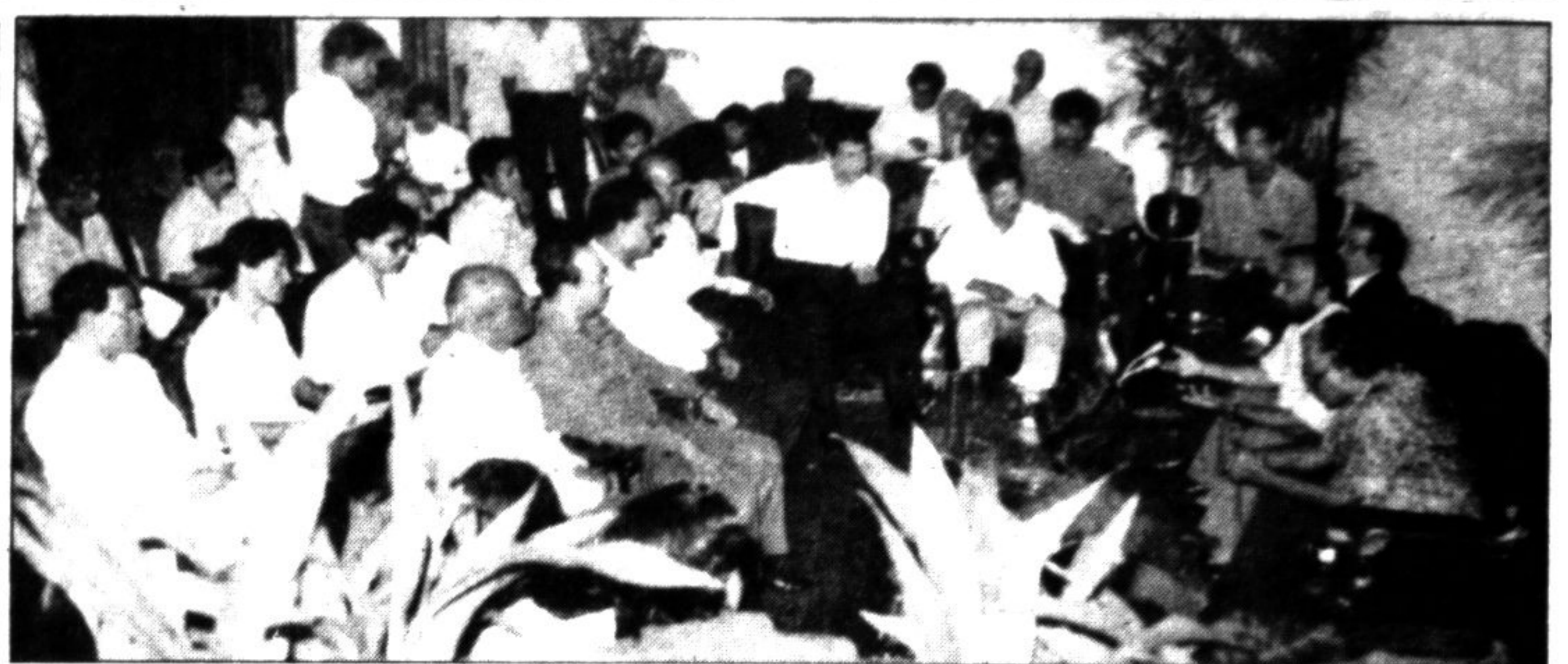
State Minister for Youth and Sports Sadek Hossain exchanging views with the sports journalists at the state guest house Padma yesterday.