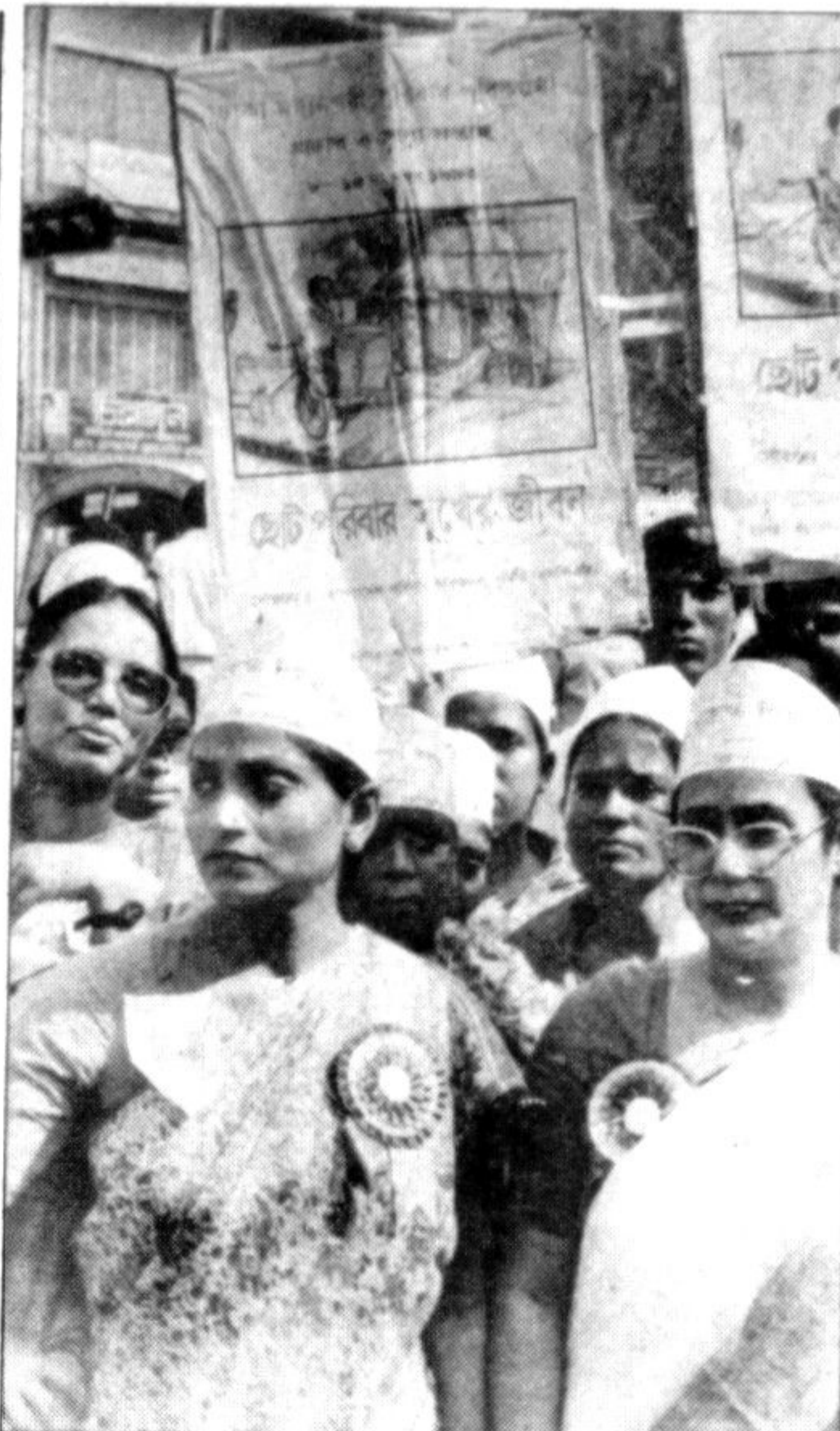
The Bangladesh Family Planning Association brought out a colourful procession in the city yesterday to mark the launching of the Dhaka Metropolitan Family Planning Publicity and Service Week. [Story on page 2]

The WB executive last night called on Health and Family Welfare Minister Chowdhury Kamal Ibne Yusuf at the latter's residence and discussed the inter-sectoral population and nutrition project and progress in population control and health services in the country.