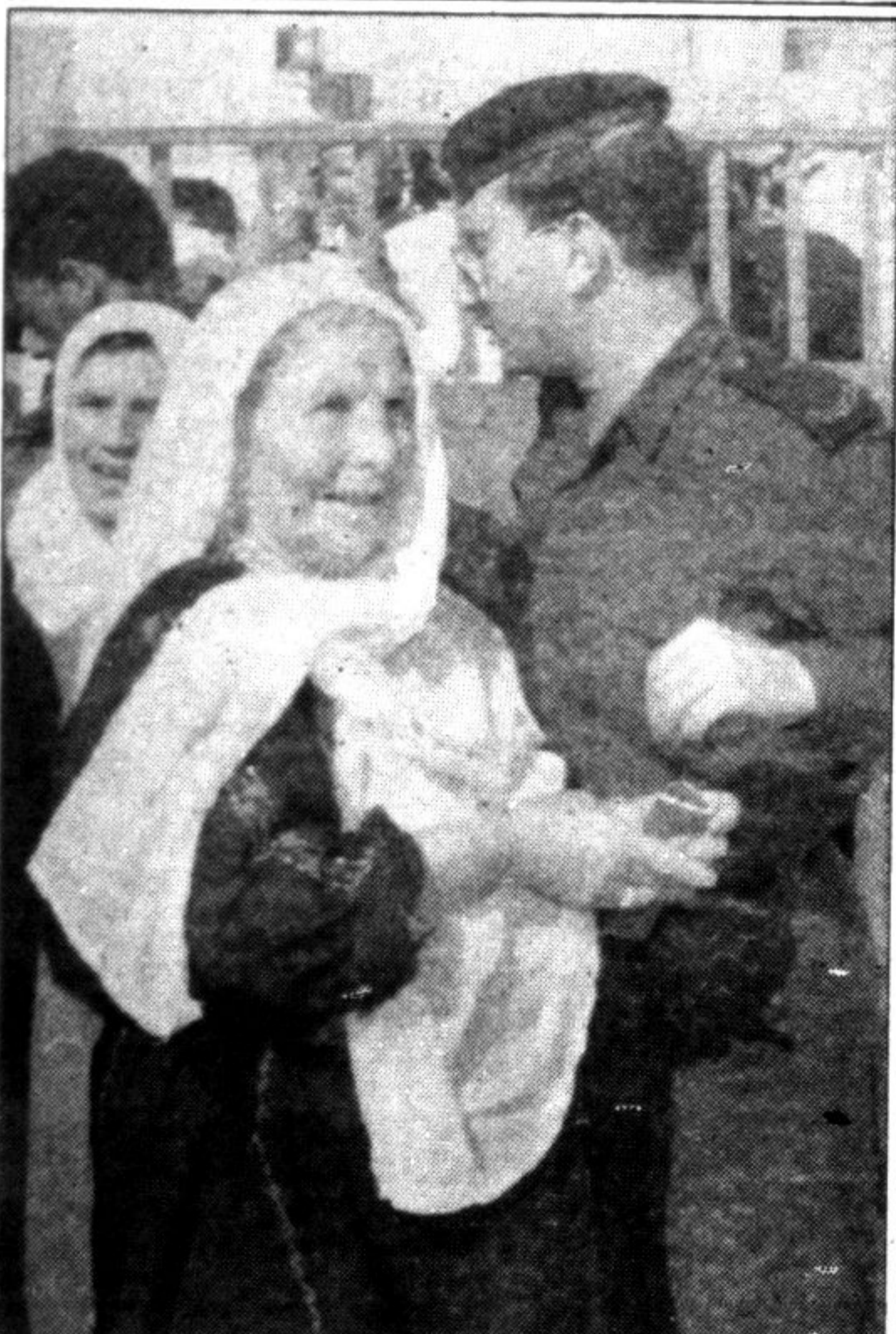
A Jordanian officer controls Palestinian women voters at the gate of a polling station at the Al-Bakaa Palestinian camp near Amman yesterday. [Story on page 5].

The claim is "absolutely baseless," a military spokesman said.