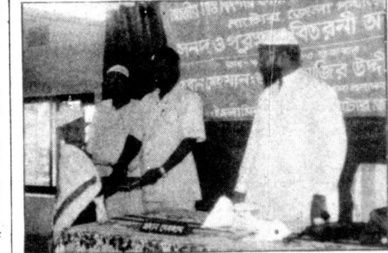
NATORE: A winner of a Islamic cultural contest held here recently is receiving prize from the local DC.