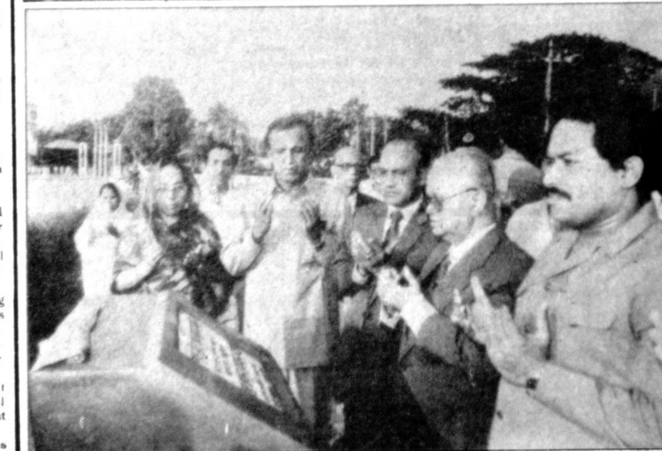
President Abdur Rahman Biswas offering munajat after laying the foundation stone of the zila board school mosque at Barisal on Saturday.

The VC of Chittagong University is receiving a fish fossil from the Assistant Chief Town Planner of CDA at a function held here recently.