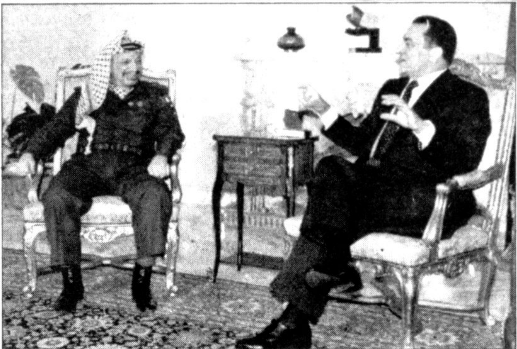
PLO Chairman Yasser Arafat (L) meets Egyptian President Hosni Mubarak (R) at the Iffhadia palace in Cairo on Sunday to discuss the Middle-East peace process and the resumption of PLO-Israeli talks.

rejection to take now, sometimes seeming to reach out to South Korea, sometimes seeming to draw back.