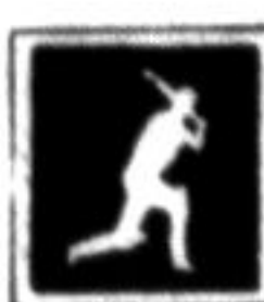
Abahani, Mohammedans and Biman — all three major contenders for the title recorded predictable facile wins in their

openers of this year's Navana Premier Division cricket league at different city venues yesterday.