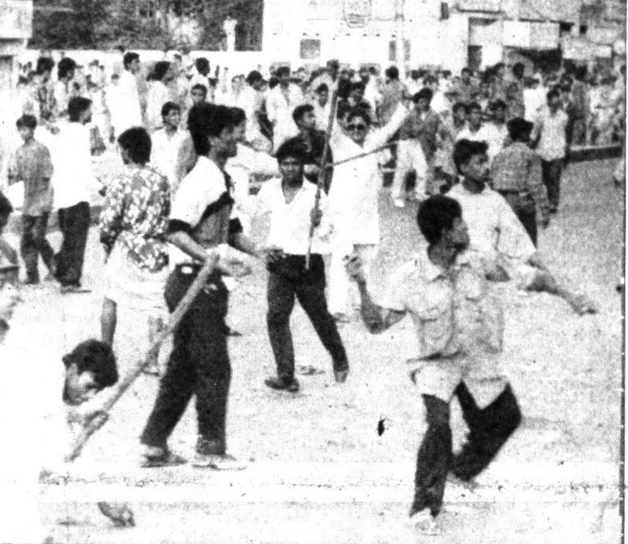
Stick-wielding and stone-throwing youngmen storm the National Sports Council during a meeting of the Nationalist Democratic Alliance at the Dainik Bangla crossing in the city yesterday.