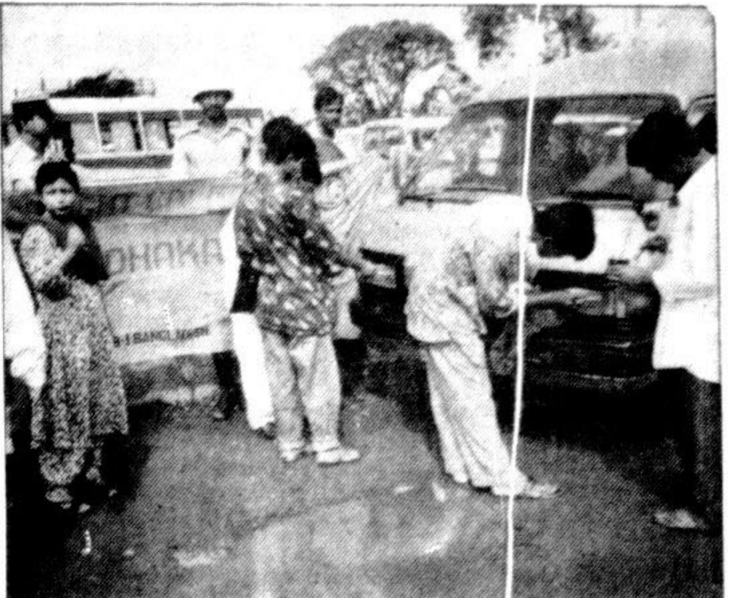
GAZIPUR: The members of Leo Club of Dhaka Turag colouring the headlights of vehicles at Tongi bazar on the occasion of 'October Service Week'.