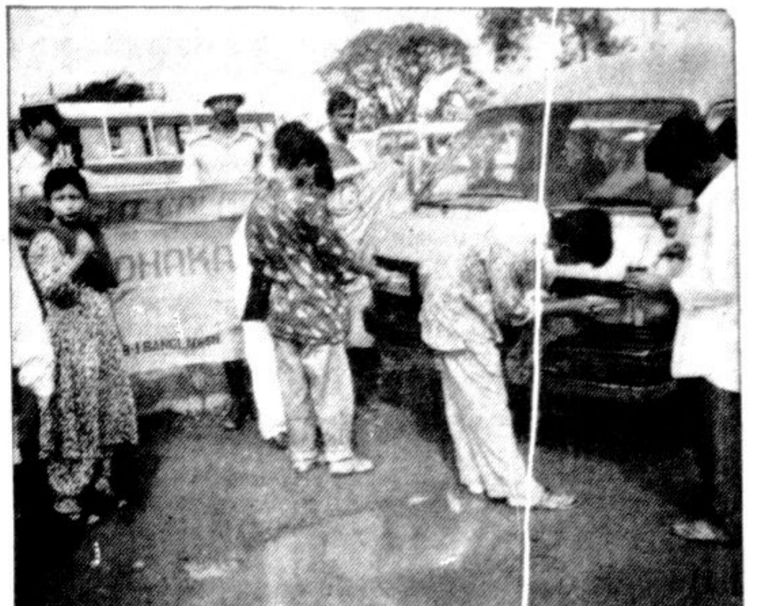
GAZIPUR: The members of Leo Club of Dhaka Turag colouring the headlights of vehicles at Tongi bazar on the occasion of 'October Service Week'.

The learned judge after examining the witnesses and evidences found the accused guilty and awarded him with the punishment in a judgement delivered on October 25.