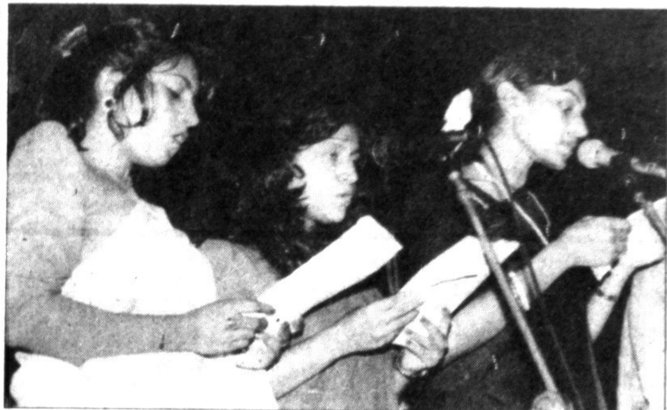
A recitation of poems of poet Rudra Muhammad Shahidulla was organised in front of Teachers Students Centre (TSC) on the DU campus yesterday to mark the 37th birth anniversary of the poet.