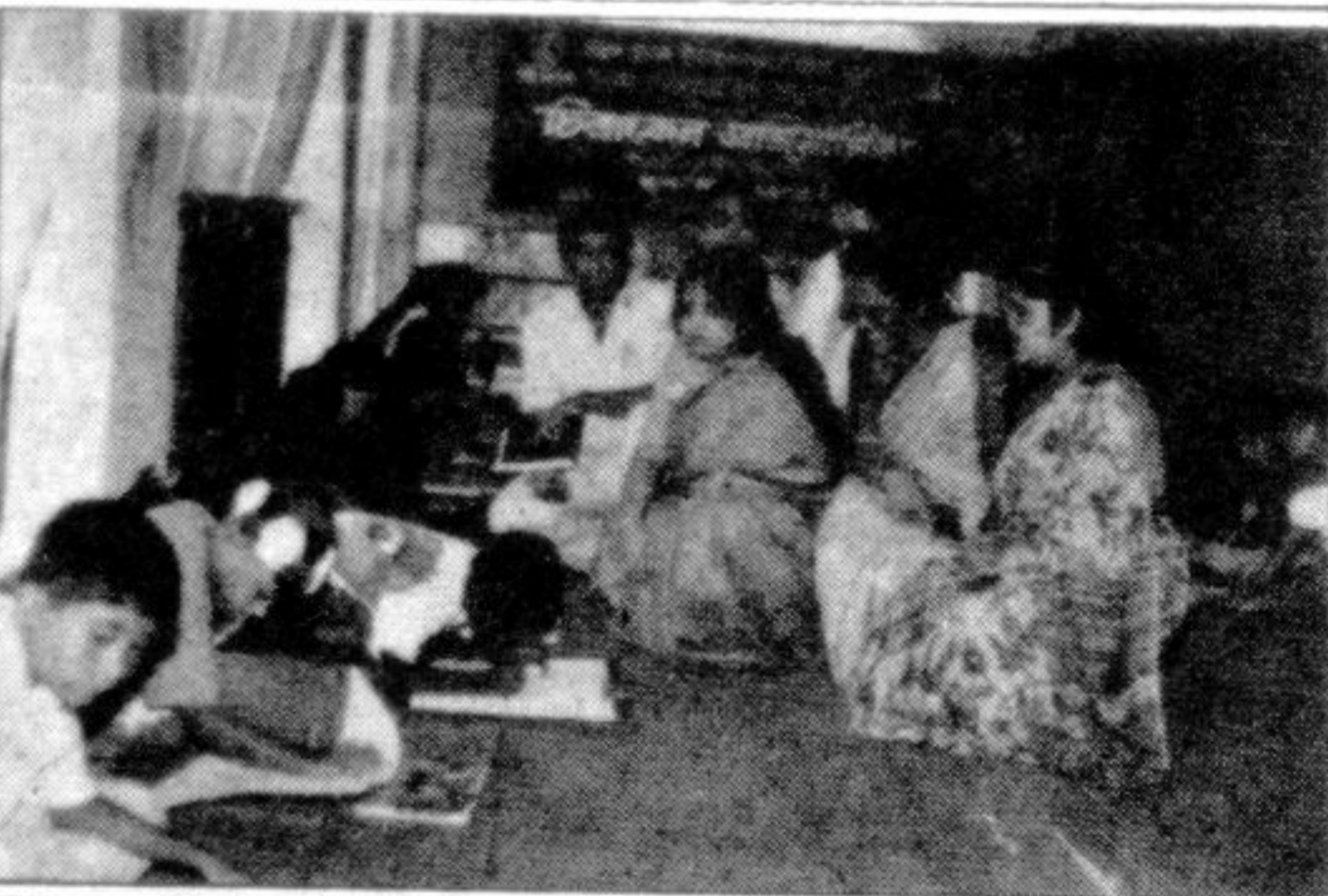
Lions Club of Dhaka Baridhara East and Lions Clubs International District 315 B 1 jointly organised an art competition at Shishu Academy on the occasion of October Service Week.