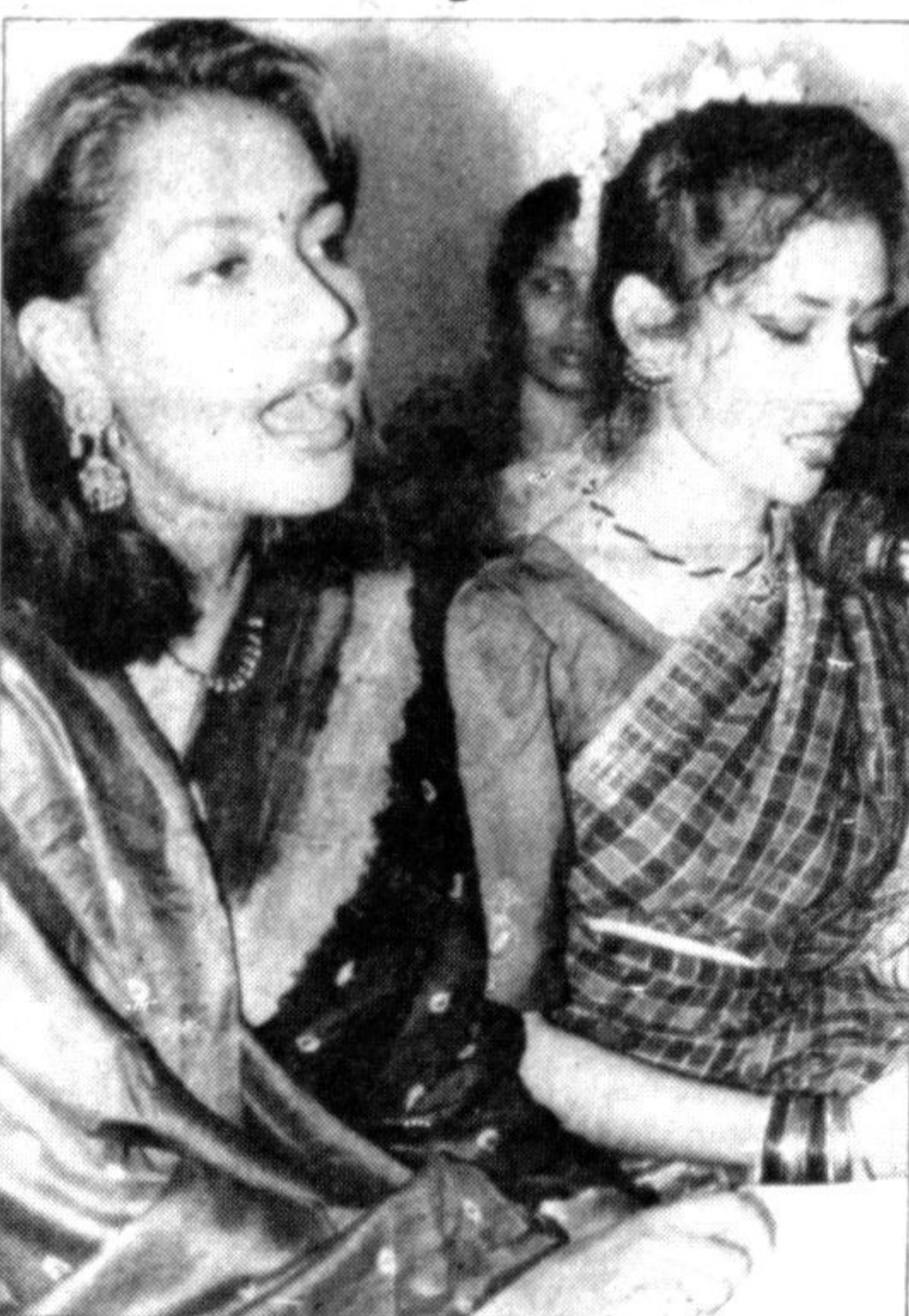
The Zia Jubo Moncho organised a cultural function in observance of National Revolution and Solidarity Day in front of the Jatiya Press Club in the city yesterday.

Metallica: (9-10 pm BST) Metal favourites who recently completed a tour of Southeast Asia. 'Enter Sandman' is among their hits.