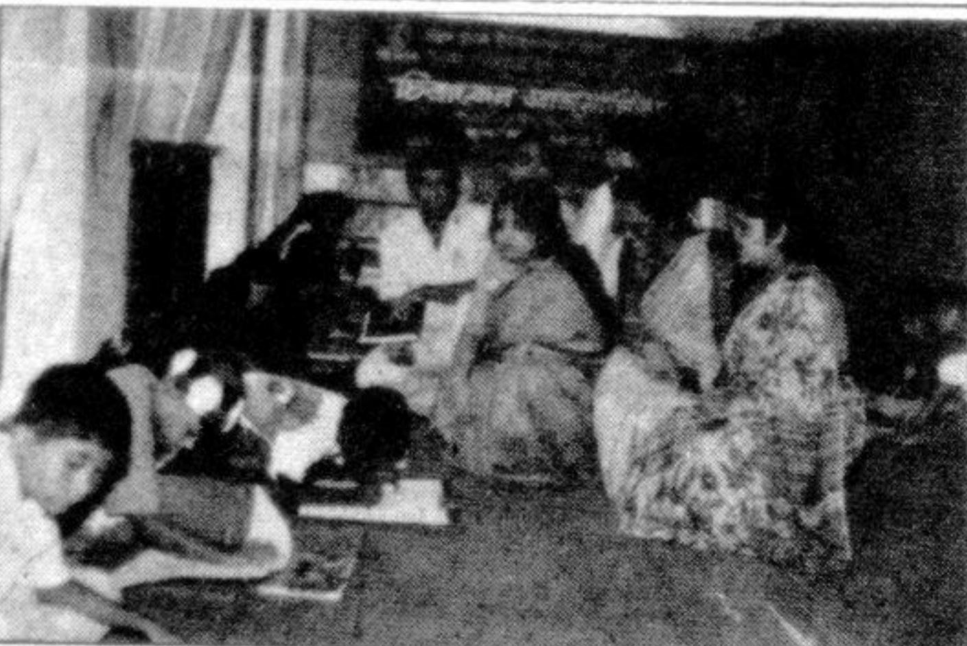
Lions Club of Dhaka Baridhara East and Lions Clubs International District 315 B 1 jointly organised an art competition at Shishu Academy on the occasion of October Service Week.