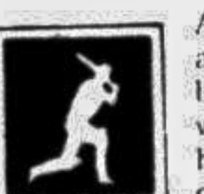
Small graphic of a batsman.

Sports Reporter. The second FH Majumder memorial snooker championship '93 will be held under the auspices of the Narayanjanj Club at the billiards room of the club from November 6 to 11.