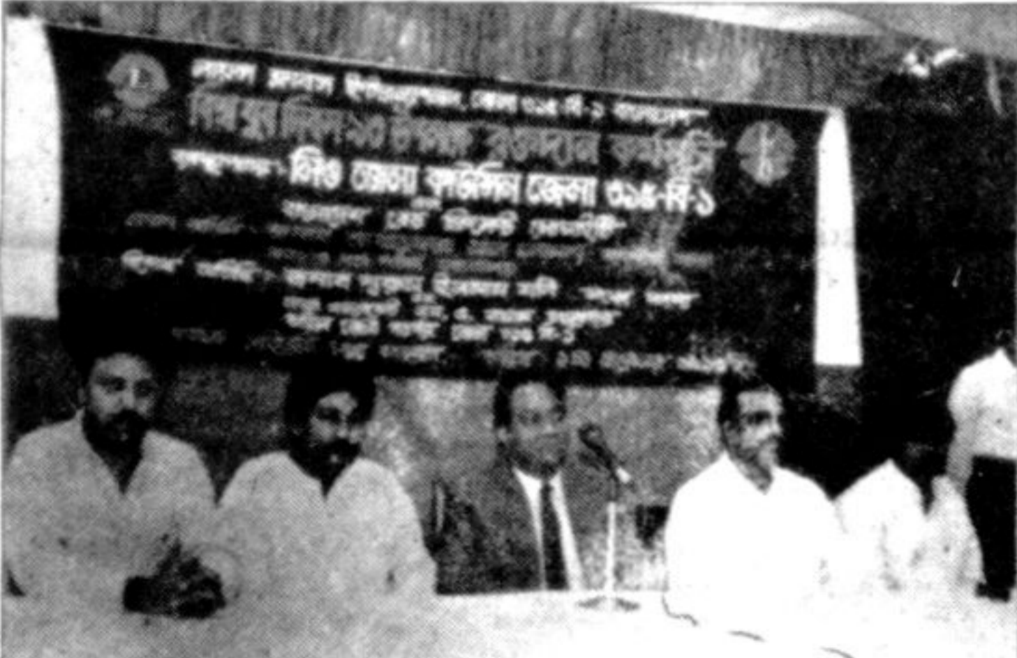
The Leo members of Lions International District 315 B 1 Bangladesh organised a blood donation programme recently on the occasion of World Youth Day. Minister for Fisheries and Livestock Abdullah Al Noman was the chief guest on the occasion. A large number of students, youths and Leo members donated blood.

Lalbagh police was aware of the incident but no case was lodged. The body of the victim was sent to the Dhaka Medical College Hospital morgue for autopsy.