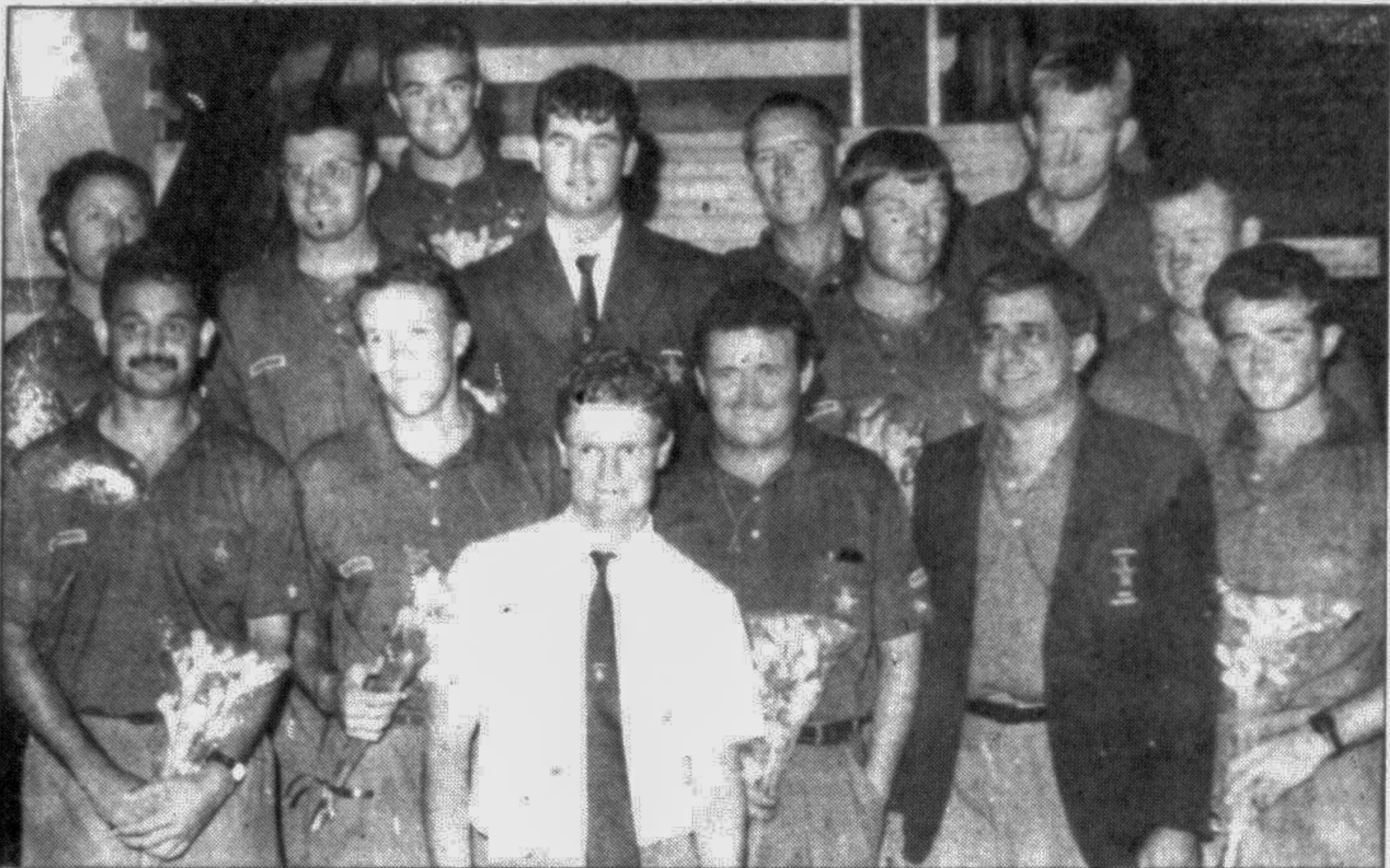
Players and officials of the visiting Zimbabwe cricket team who arrived yesterday to play against Bangladesh in the Gold Leaf one-day international series. The two exhibition matches will be played at the Dhaka Stadium on November 3 and 4.