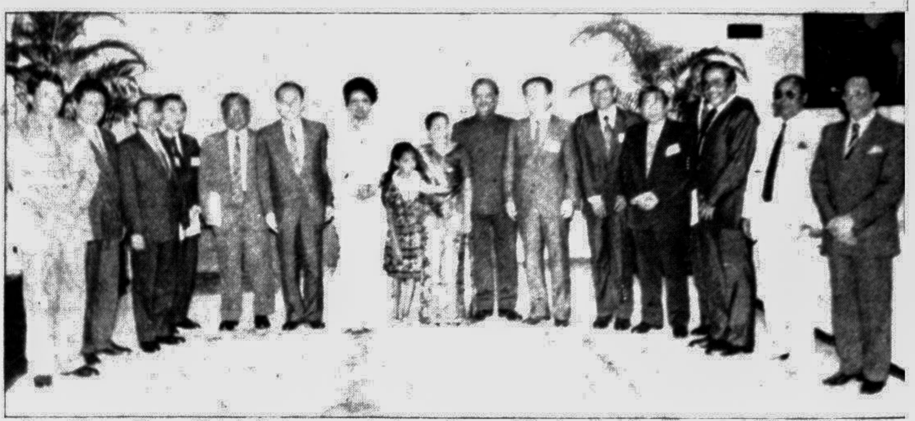
Prime Minister Begum Khaleda Zia is seen with the participants of the three-day eleventh meeting of Health Ministers of the WHO Southeast Asia Region. The Prime Minister inaugurated the eleven-nation meeting at the International Conference Centre in the capital yesterday.