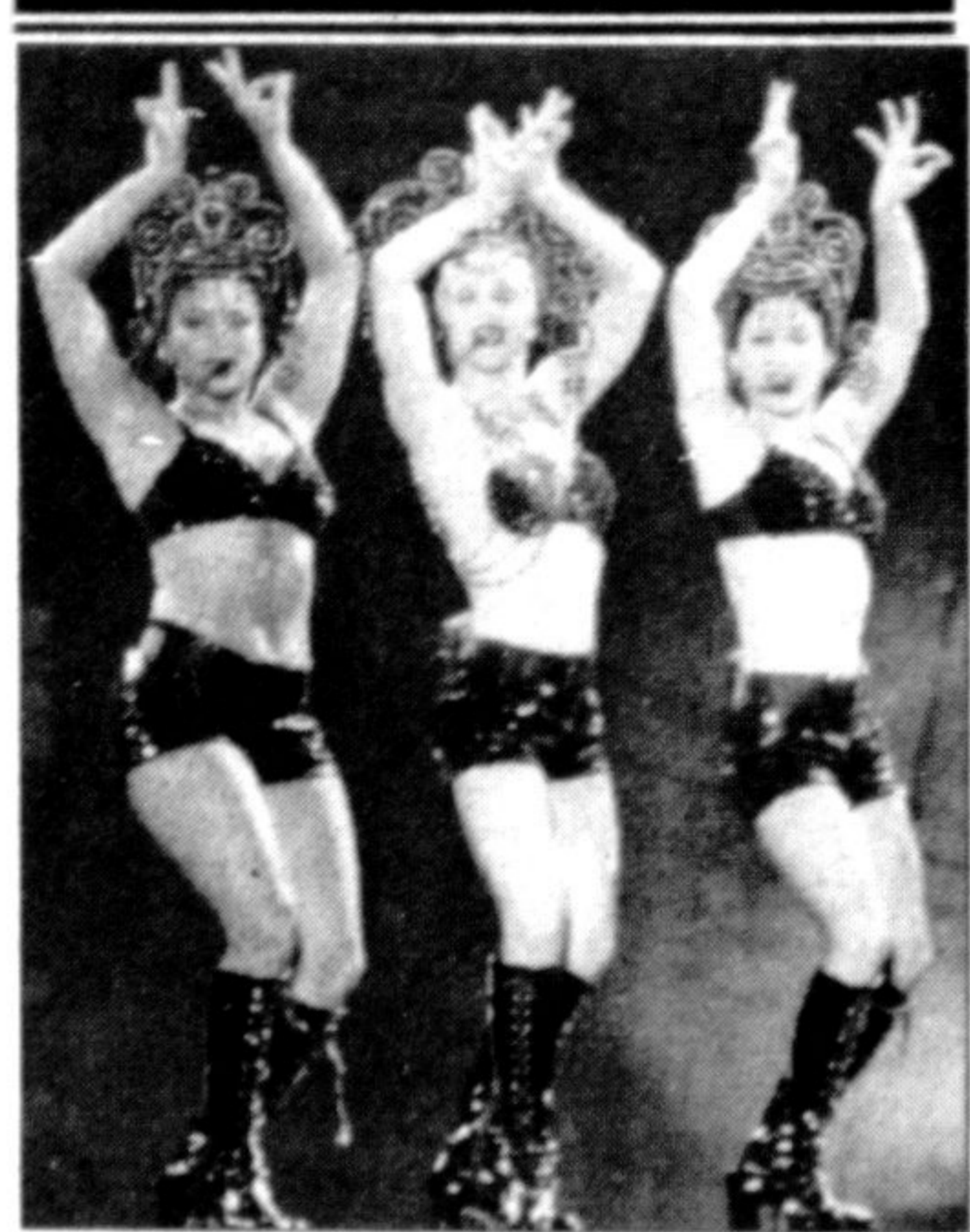
US entertainer Madonna (C) and two members of the cast of her current production perform on Saturday at the River Plate Stadium in Buenos Aires as Madonna continues the South American portion of her ongoing world tour.