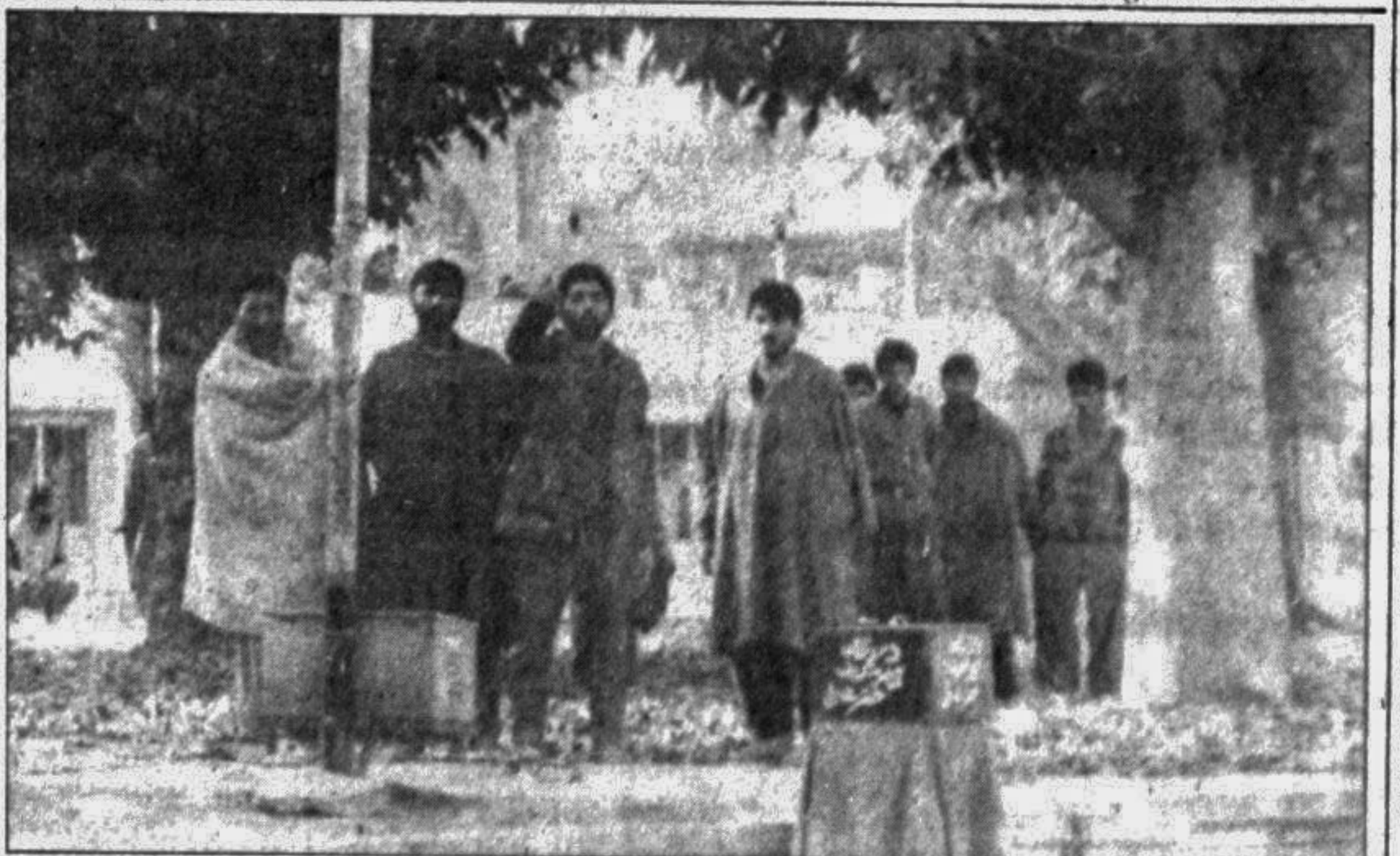
Civilians held up inside the Hazratbal Mosque along with some 50 armed Muslim militants shout responses to reporters during an unusual press conference outside the shrine in Srinagar yesterday.