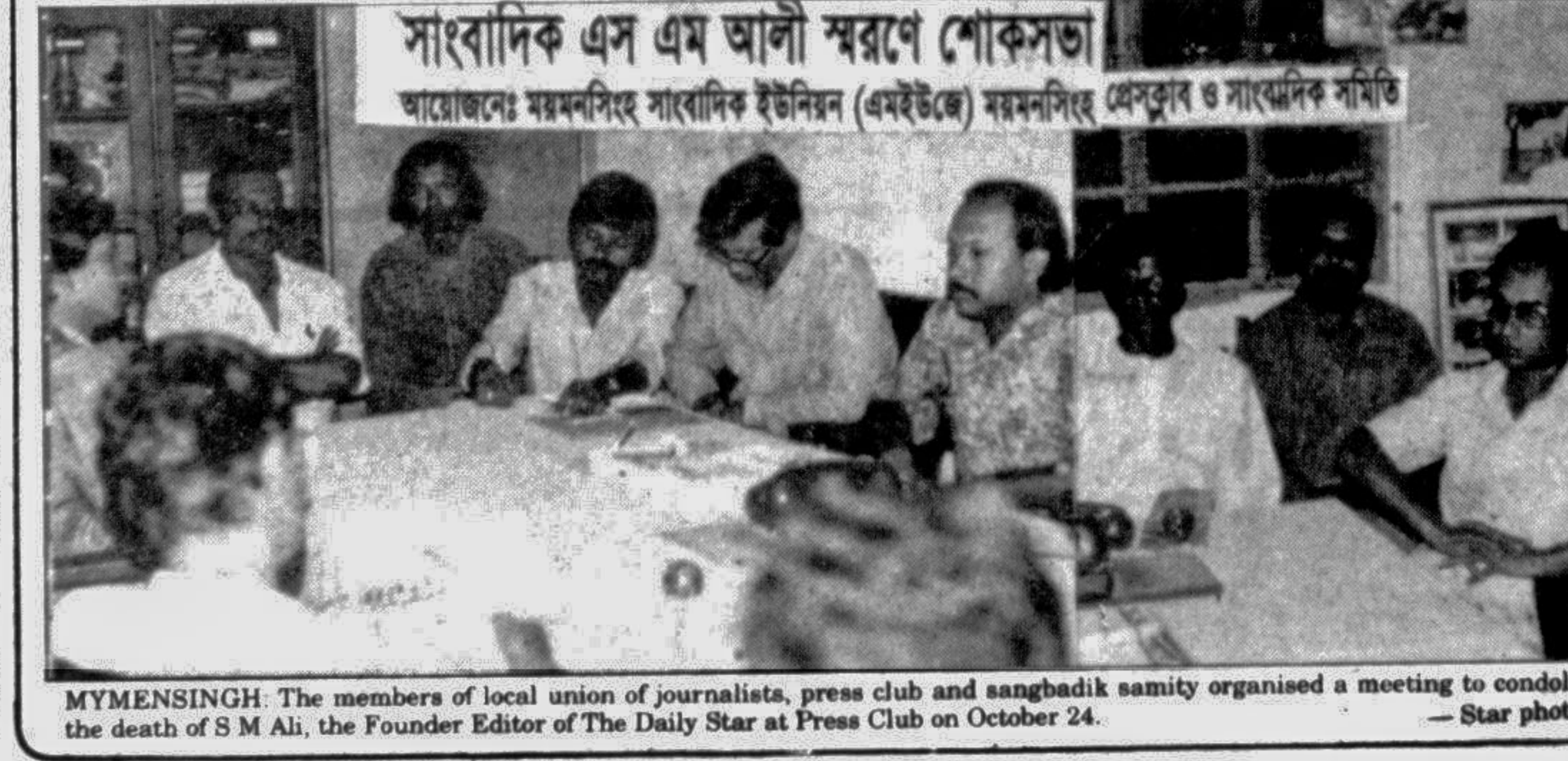
MYMENSINGH: The members of local union of journalists, press club and sangbadik samity organised a meeting to condole the death of S M Ali, the Founder Editor of The Daily Star at Press Club on October 24.

The general subscribers complain that their sets remain dead for maximum hours every day.