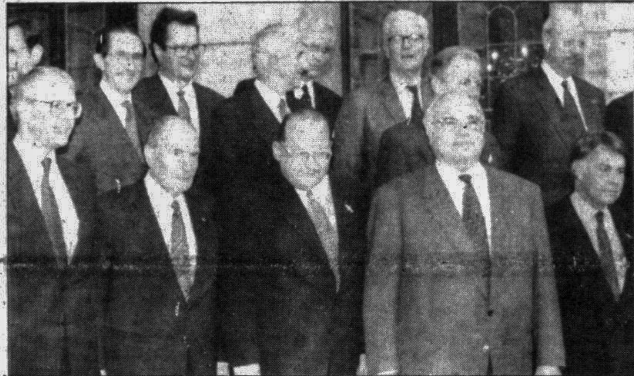
European heads of state pose for photographers after the EC summit in Brussels yesterday (L-R): British Prime Minister John Major, French President Francois Mitterrand, Belgian Prime Minister Jean Luc Dehaene, German Chancellor Helmut Kohl and Spanish Prime Minister Felipe Gonzalez. Second row (L-R): Belgian Foreign Minister Wily Claes, German Foreign Minister Klaus Kinkel, Luxemburg Foreign Minister Jacques Poos, Dutch EC Commissioner Hans Van Den Broek, British Foreign Secretary Douglas Hurd, Luxemburg Prime Minister Jacques Santer and Dutch Foreign Minister Peter Kooijmans.