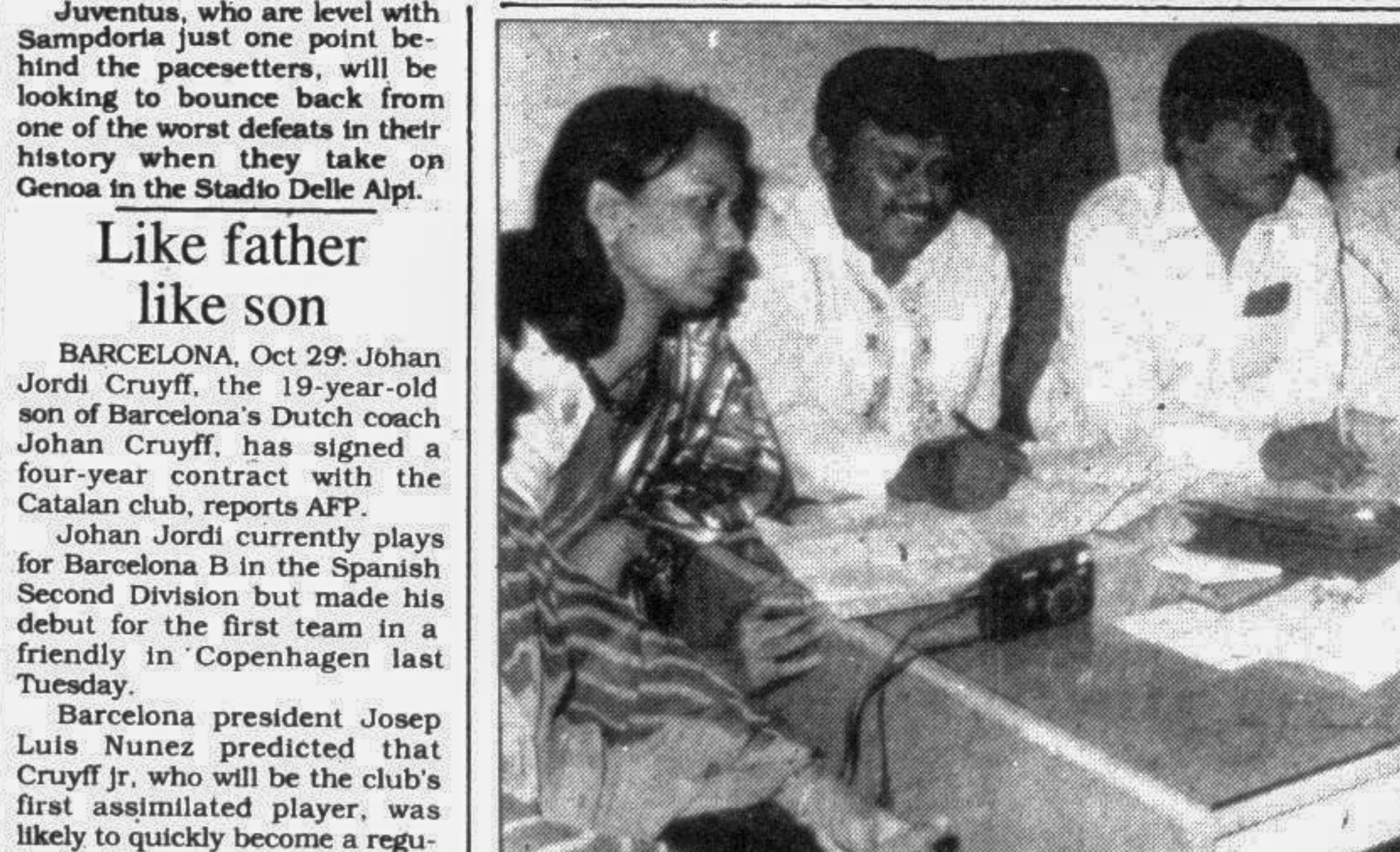
LONELY LADY: There are moments when one can feel pretty lonely even in a crowd. This young lady who yesterday entered the DMFA office, now being used as a make shift recruiting office for liaison officers for the forthcoming SAF Games, with a view to get the job seems to be in her elements while taking on the interviewers. Seven-nation SAF Games begins here in Dhaka from December 20.