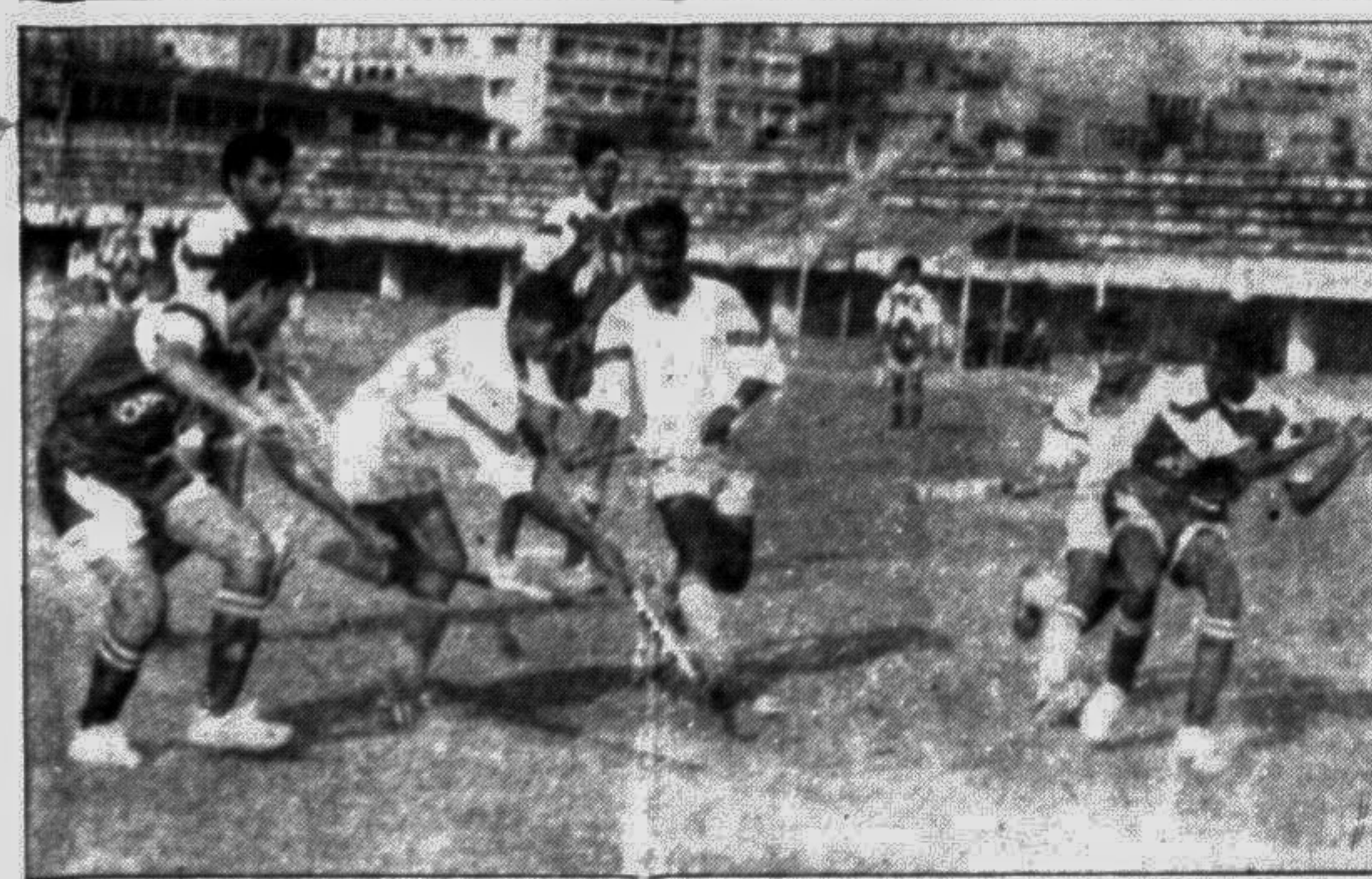
Action from yesterday's Green Delta Second Division league match between Uttara Hockey Club and Barnak Samaj at the Hockey Stadium. Barnak won the match 2-0.

LONDON, Oct 26: Former world featherweight boxing champion Barry McGuigan, who retired in 1989, is considering a comeback, reports Reuters.