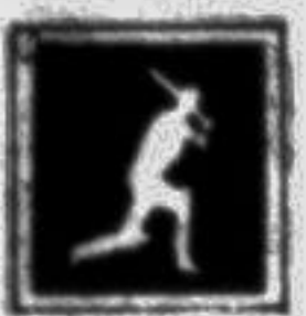
Board (BCCB) XI lost their third