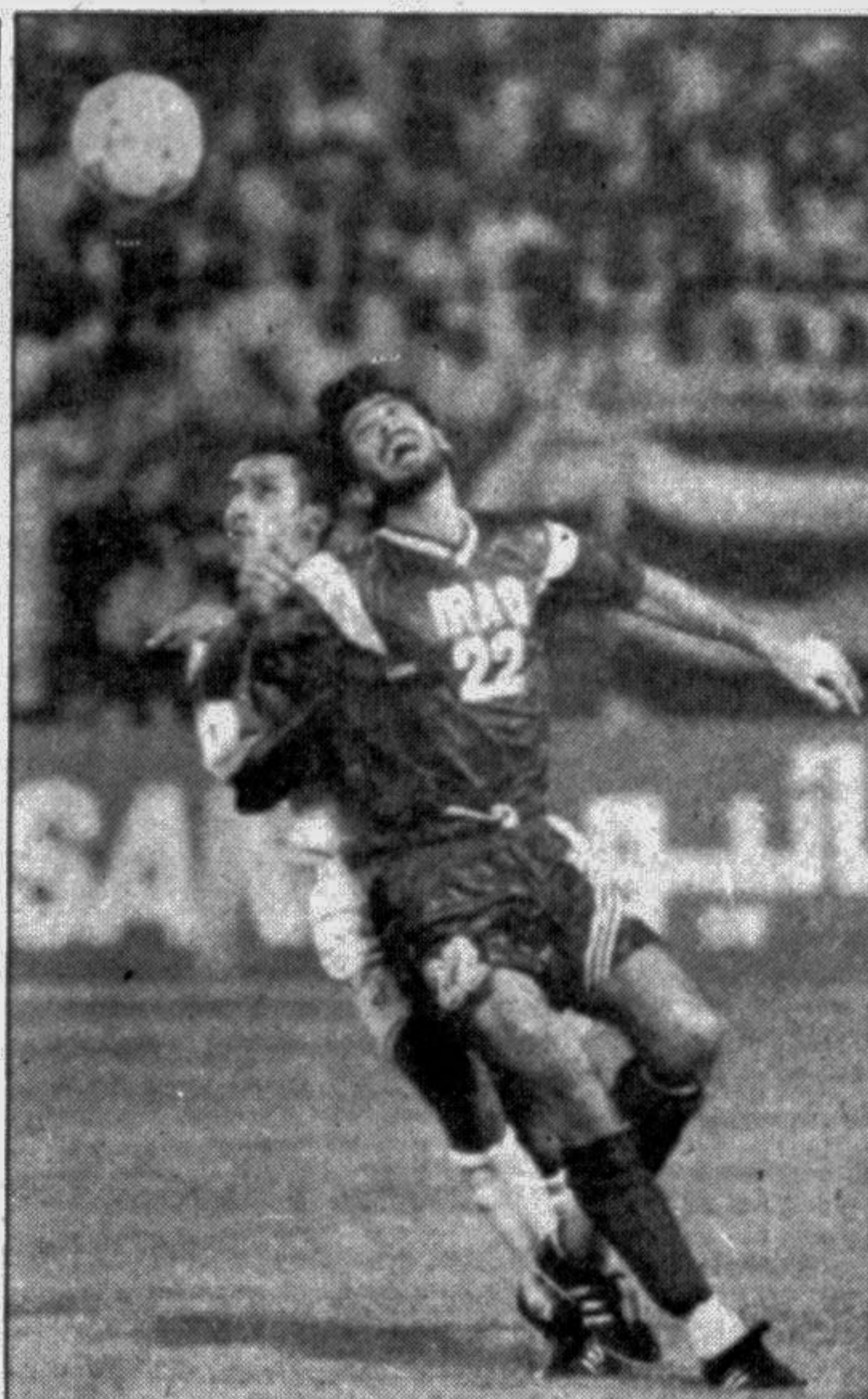
Iraqi player Bassam Hameed duels with Saudi Arabia's Sami Aljaber during their World Cup qualifying match at the Khalifa Stadium in Doha on Oct 24. The match ended 1-1.

ended in humiliating defeats. South Korea have continued their buildup, making them one of Asia's leaders. Confidence increased after South Korea represented Asia in World Cup championships in 1986 and again in 1990. But since 1990, many Korean fans have turned to professional baseball, making it the nation's most popular sports. TEAMS JAPAN: Shigetatsu Matsunaga, Toshinobu Katsuya, Takumi Horike, Tetsuji Hashiratani (Cap), Masami Ihara, Ruy Ramos, Kazuyoshi Miura, Kenta Hasegawa, Tsuyoshi Kitazawa, Mitsunori Yoshida, Masashi Nakayama (Nobuhiro Takeda). SOUTH KOREA: Choi In Young, Chung Jong Son, Park Jung Bae, Noh Jung Yoon, Shin Hong Gi, Choi Moon Sik, Ha Seok Ju, Ko Jeong Woon, Kim Joo Sung, Gu Sang Bum (Cap), Hong Myung Bo. Referee: Aron Schmidhuber (Germany).