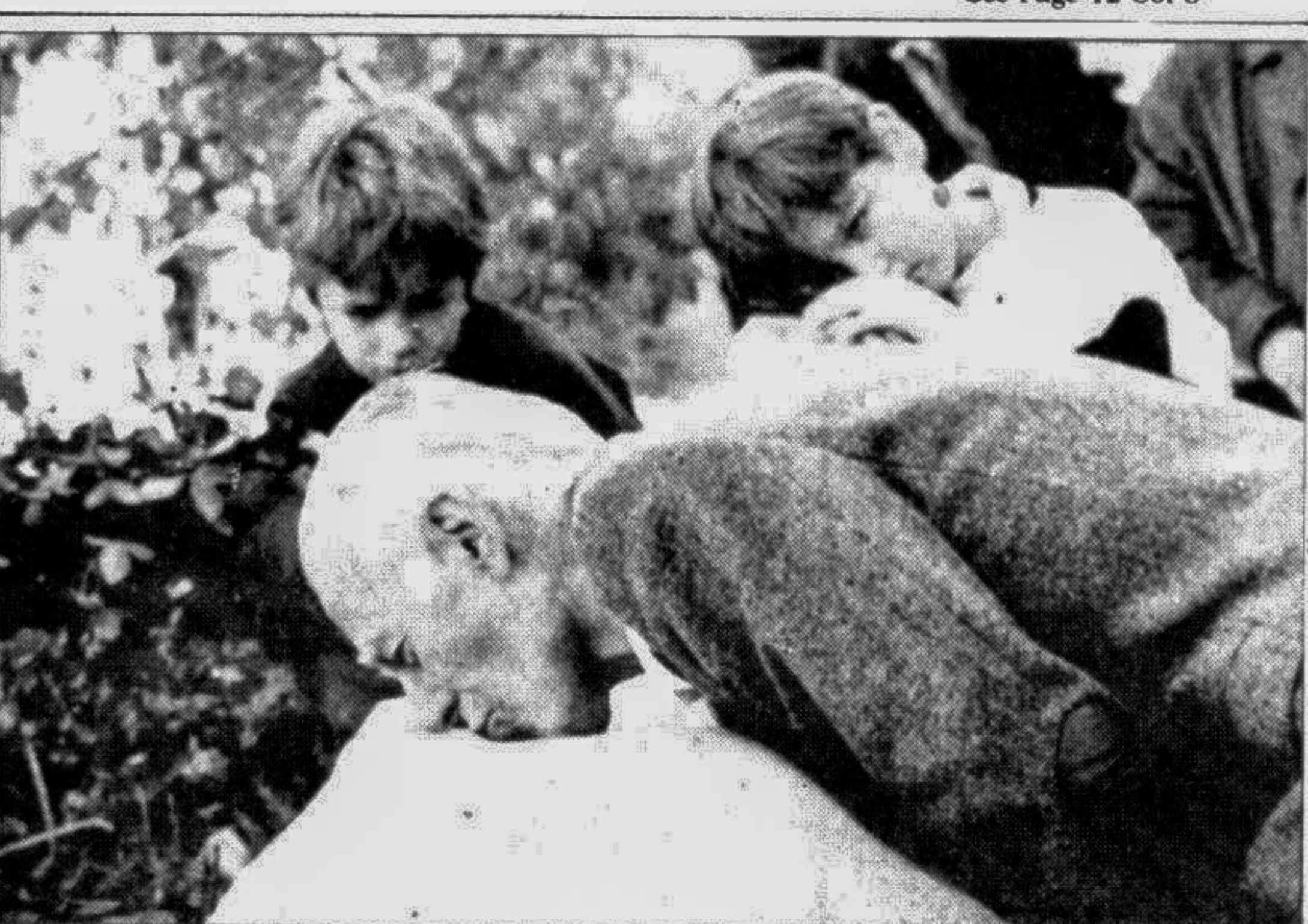
Two small boys watch as a relative kisses for the last time the body of his dead son, during his funeral yesterday in Sarajevo. The man's son was killed while serving in the Bosnian Army.

S Y Bakht The Supreme Court is expected to take action regarding the gross irregularities detected in a number of district courts during recent inspections by judges of the country's apex court. According to informed sources, the inspection and inquiry conducted in the civil and criminal courts of six districts revealed serious anomalies including procedural lapses, poor maintenance of judicial records and non-compliance with the civil rules and order (CRO). The Supreme Court judges, including the Chief Justice, carried out the inspections from September 12 during the ongoing annual vacation of the court. Chief Justice Shahabuddin Ahmed personally inspected the courts in both Sylhet and Tangail districts while other judges visited the courts in Narail, Moulvibazar and Habiganj. Justice Mahmudul Amin Chowdhury also led an investigation into alleged irregularities at the Satkhira district court. The Supreme Court judges have inspected the civil and criminal courts of 30 districts since April 1992. According to the sources, the Supreme Court judges, during the inspections, found that some of the magistrates and judges in the district courts failed to arrive on time to carry out their judicial functions. In some instances magistrates and judges arrived in the courts at 11 am, 12 pm or even as late as 3 pm instead of the official time of 10:30 am. Some of the court officials were also found to be delaying the announcement of judgments even more than a year after. See Page 12 Col 8