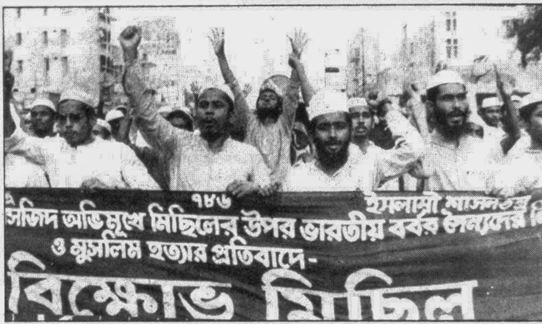
The Islami Shashanttra Chhatra Majlish brought out a procession in the city yesterday protesting firing of Indian forces on processionists marching towards Hazratbal Mosque, Kashmir's holiest shrine, in Jammu-Kashmir state of India.

Application in plain paper (which will be treated with strict confidentiality) with complete curriculum-vitae, one photograph, and a self-addressed envelop duly stamped should be addressed in care of the Advertiser G.P.O. Box No. 3433, Dhaka on or before November 7, 1993.