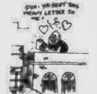
On the Roof Page 3