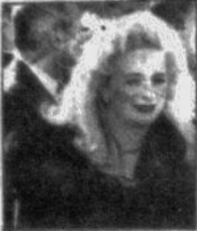
Yasser Arafat and his wife Souha pose for photographers at Le Bourget airport in France Page 5