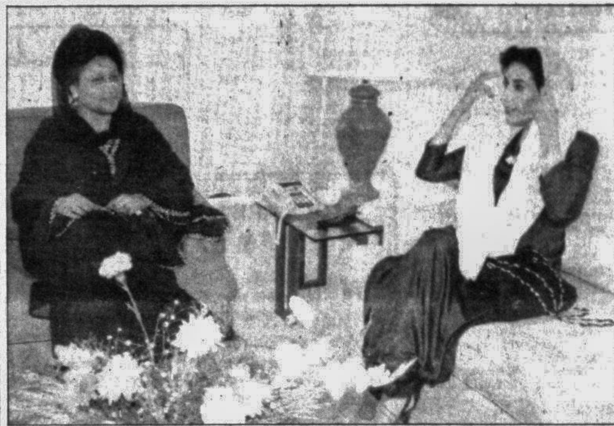
Prime Minister Begum Khaleda Zia talking with Pakistan Prime Minister Benazir Bhutto during their meeting at Le Meridien hotel in Limassol, Cyprus yesterday.

A government spokesman said that mediators held three rounds of negotiations with the militants Friday but declined to reveal details of the talks.