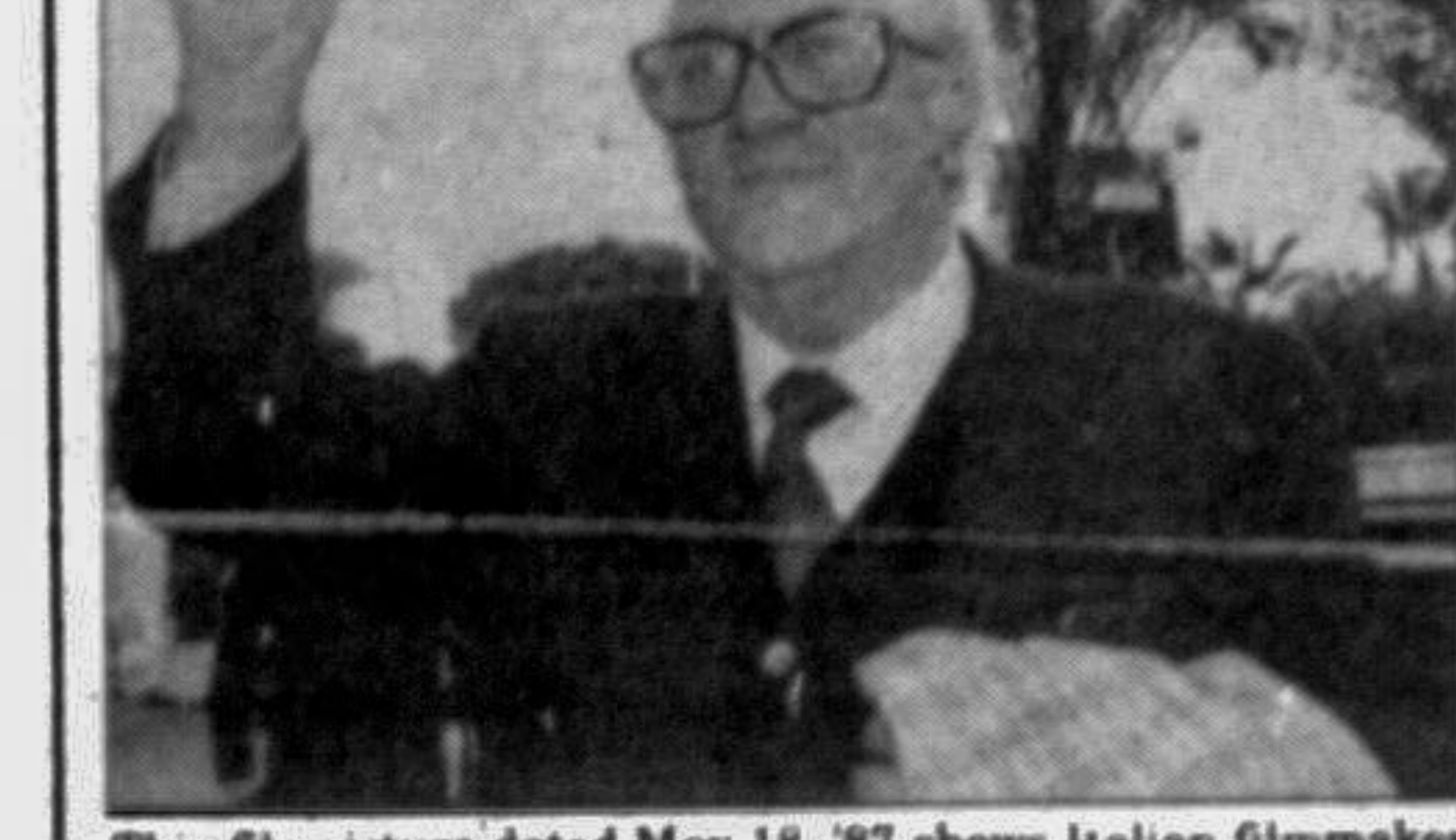
This file picture dated May 18, '87 shows Italian filmmaker Federico Fellini at the Cannes film festival in the South of France.

Venezuela orders deportation of British writer: CARACAS, Oct 19: Venezuela Monday ordered the deportation of British writer David Yallop for "disrespect," as a result of charges he made against police and officials in defending a suspect in the 'Yuppie' bombing case, reports Reuters.