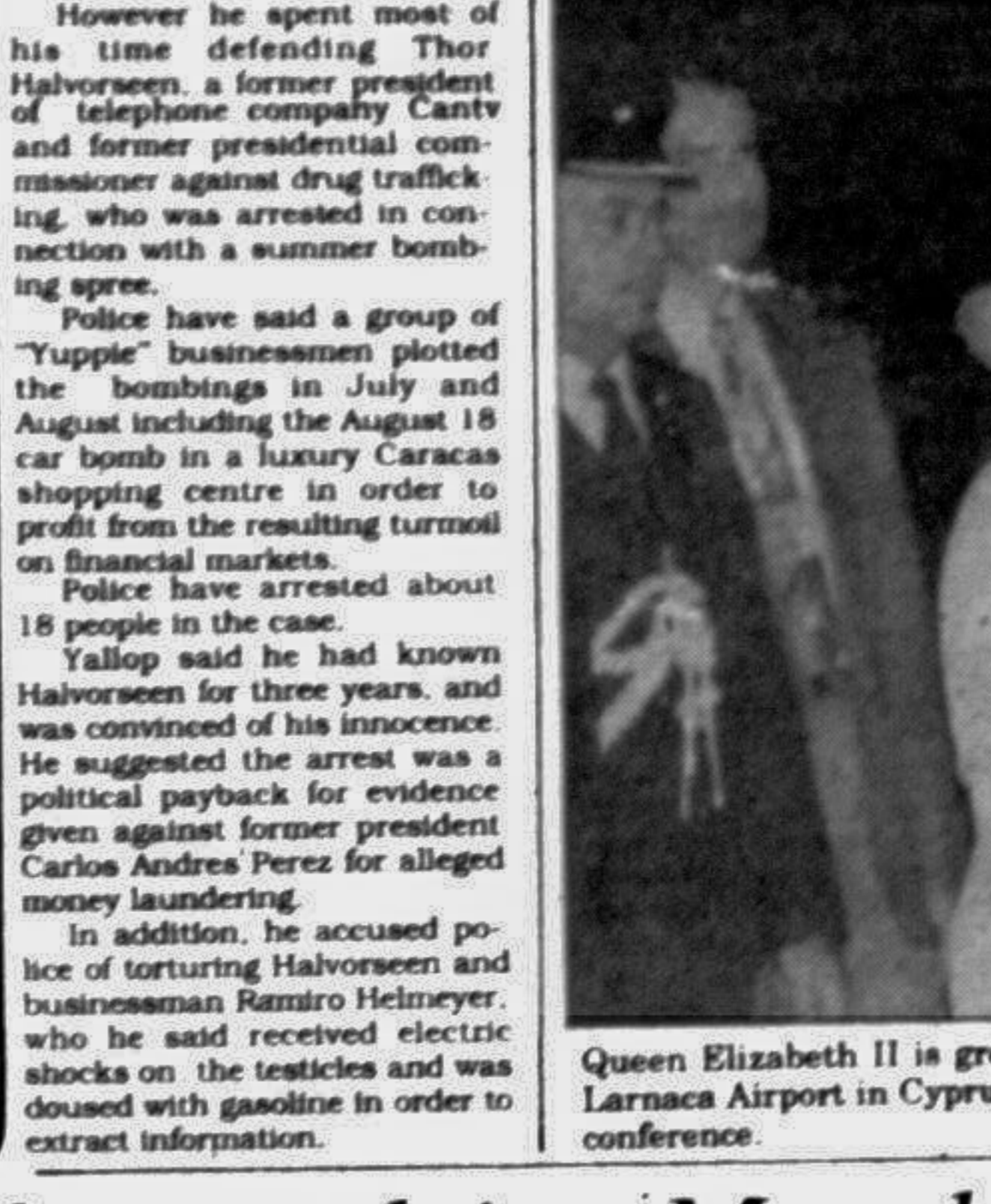
Queen Elizabeth II is greeted by Cyprus President Glafkos Clerides (C) upon her arrival at Larnaca Airport in Cyprus on Monday. The Queen starts a six-day visit to the Commonwealth conference.

Cyanide leak kills 6 in China: BEIJING, Oct 19: A leak of lethal cyanide from an oil well in northeast China killed six oil workers and injured hundreds, an official report said Tuesday, reports AP.