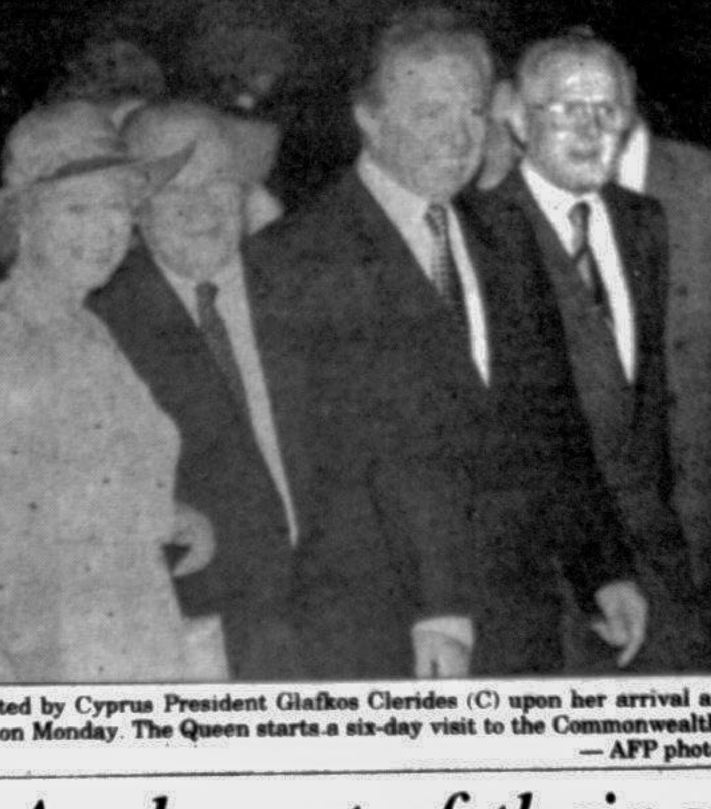
Queen Elizabeth II is greeted by Cyprus President Glafkos Clerides (C) upon her arrival at Larnaca Airport in Cyprus on Monday. The Queen starts a six-day visit to the Commonwealth conference.

China, Taiwan agree to resume talks: BEIJING, Oct 19: China and Taiwan have agreed to resume unofficial talks after a break of nearly two months, but are still wangling over the date and location of the negotiations, it was reported today, says AFP.