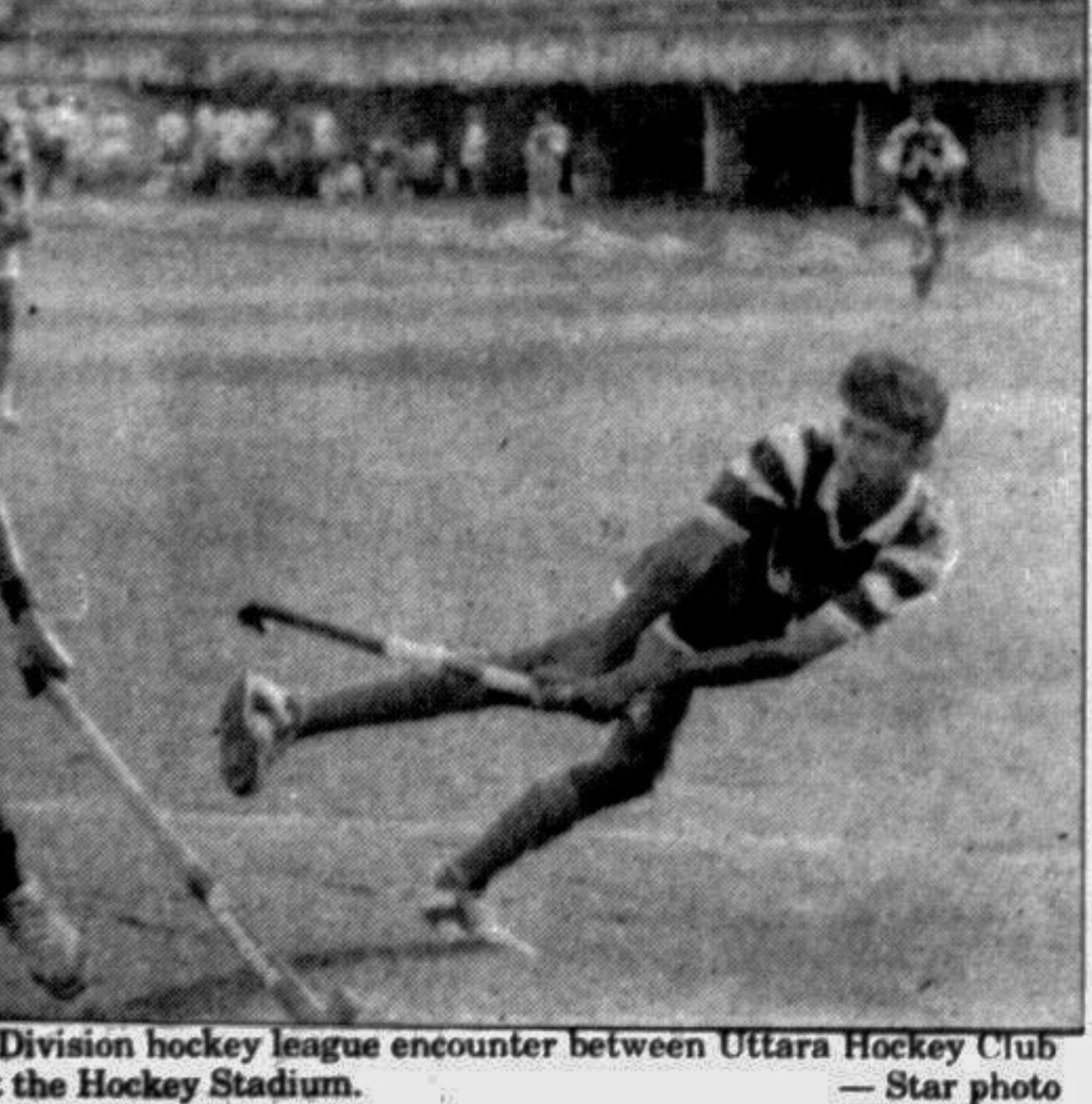
Scene from yesterday's Second Division hockey league encounter between Uttara Hockey Club and Combined Sporting Club at the Hockey Stadium.