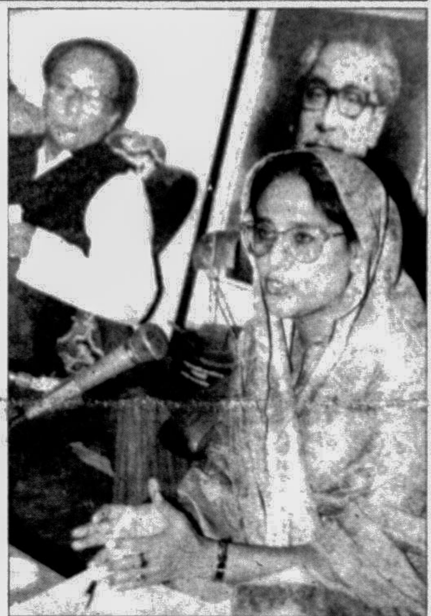
Awami League chief and Leader of the Opposition in Parliament Sheikh Hasina addressing a press conference at her Minto Road residence in the city yesterday.