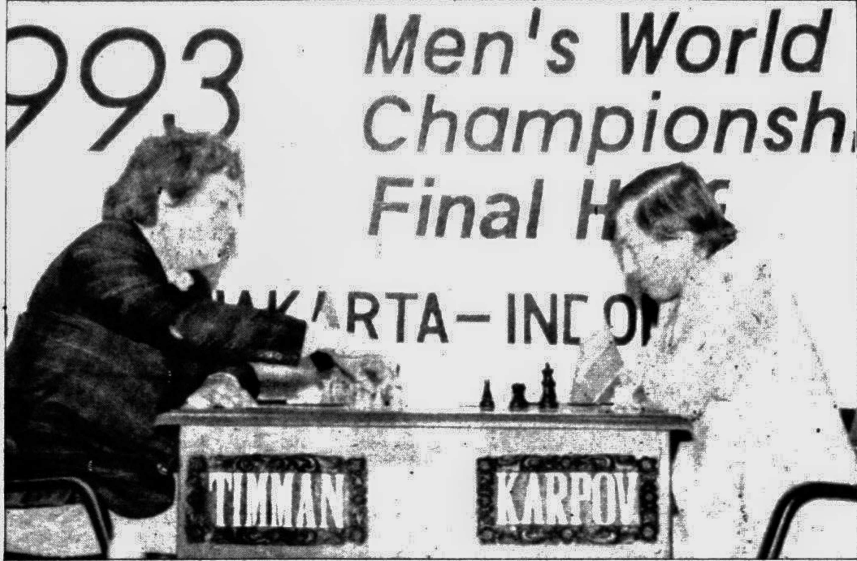
Dutch Grandmaster Jan Timman makes a move in the drawn 13th match against Russian Grandmaster Anatoly Karpov in World Chess Championship, organised by FIDE in Jakarta on October 17. Karpov and Timman have already played 12 games in the Netherlands, with Karpov leading 7.5-5.5.