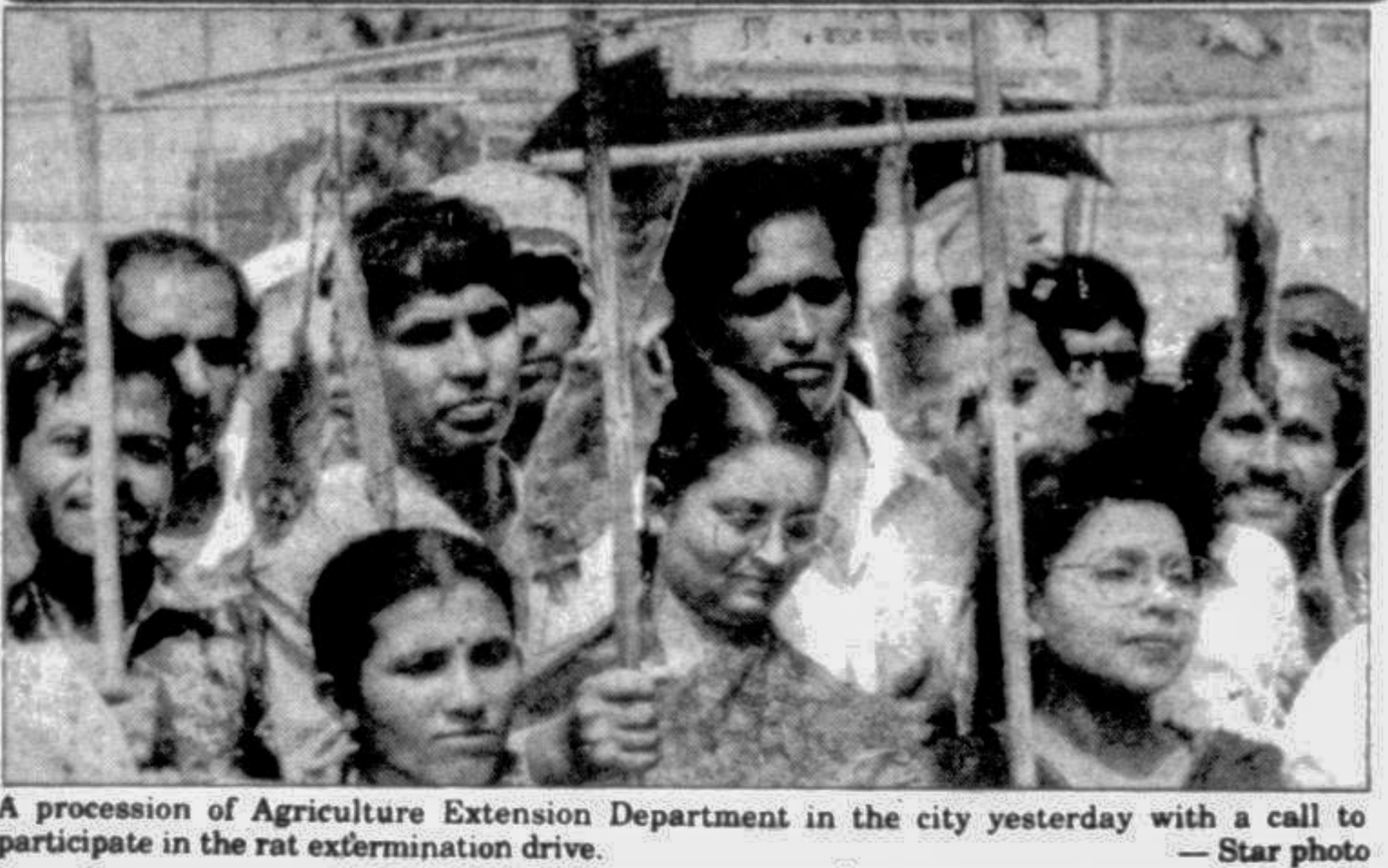
A procession of Agriculture Extension Department in the city yesterday with a call to participate in the rat extermination drive.

available to the hapless Dhakaite the benefits of that wonderful gadget, the Cellular Phone. The only problem being again, that you only have to have a car, to be able to use one.