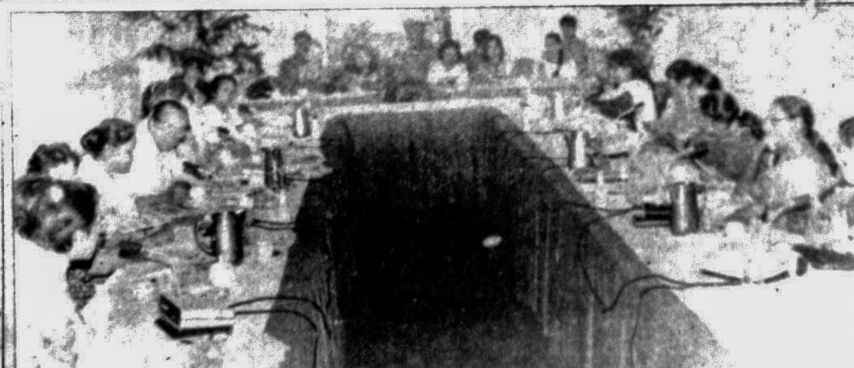
Participants in The Daily Star Round Table on the "Girl Child: Some Priority Concerns" held at the Hotel Sheraton yesterday.

Today's issue contains a 2-page Special on the Unicef cartoon series MEENA Pages 6 and 7