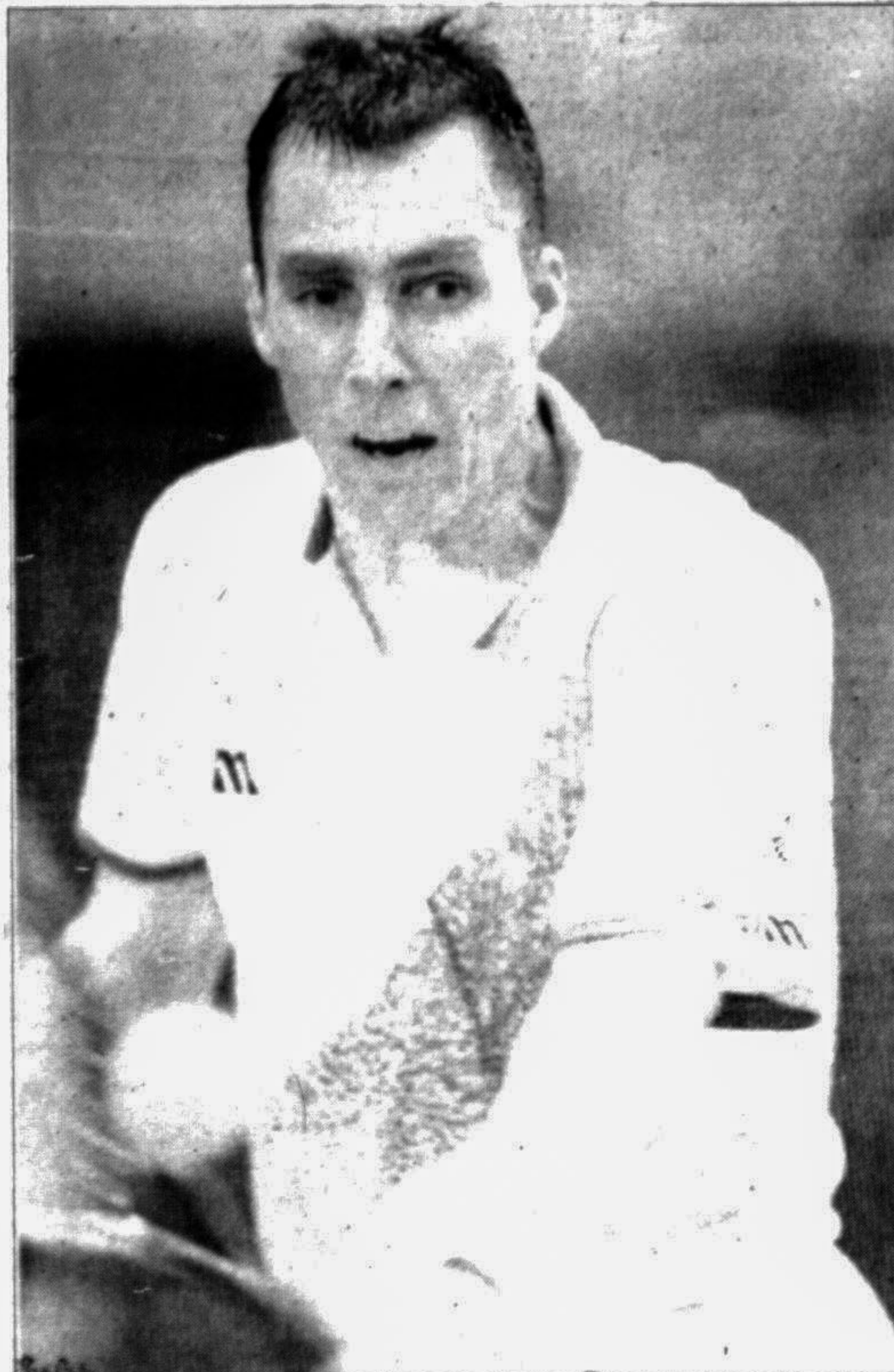
Former world number one Ivan Lendl makes a backhand return against Dutch Paul Haarhuis during their semifinal encounter in the Seiko Super tennis tournament yesterday in Tokyo. Lendl, the defending champion came back from behind to beat younger rival.

Navratilova, who has won six titles at the event, had trouble with her serve-and-volley game. In the first set against Zvereva, she only held serve once. The American, ranked second in the world, said she's had a hectic playing schedule since May and plans to take the next week off. "It's a relief that it's over," said the 36-year-old. "I'm not physically tired. I'm emotionally tired." In Saturday's semifinals, Garrison-Jackson will face third-seeded Mary Pierce of France, who outlasted Germany's Barbara Rittner 4-6, 6-3, 7-5. Navratilova did not manage to get her serve on track until the third game of the second set, when she slammed three volleys for winners. Zvereva, one of the world's best doubles players, hit a forehand passing shot past the American to close out the match in one hour, 30 minutes. Zvereva, ranked 20th in the world, has won nine Grand Slam titles in doubles with various partners. Garrison-Jackson broke Martinez, the world's fifth-