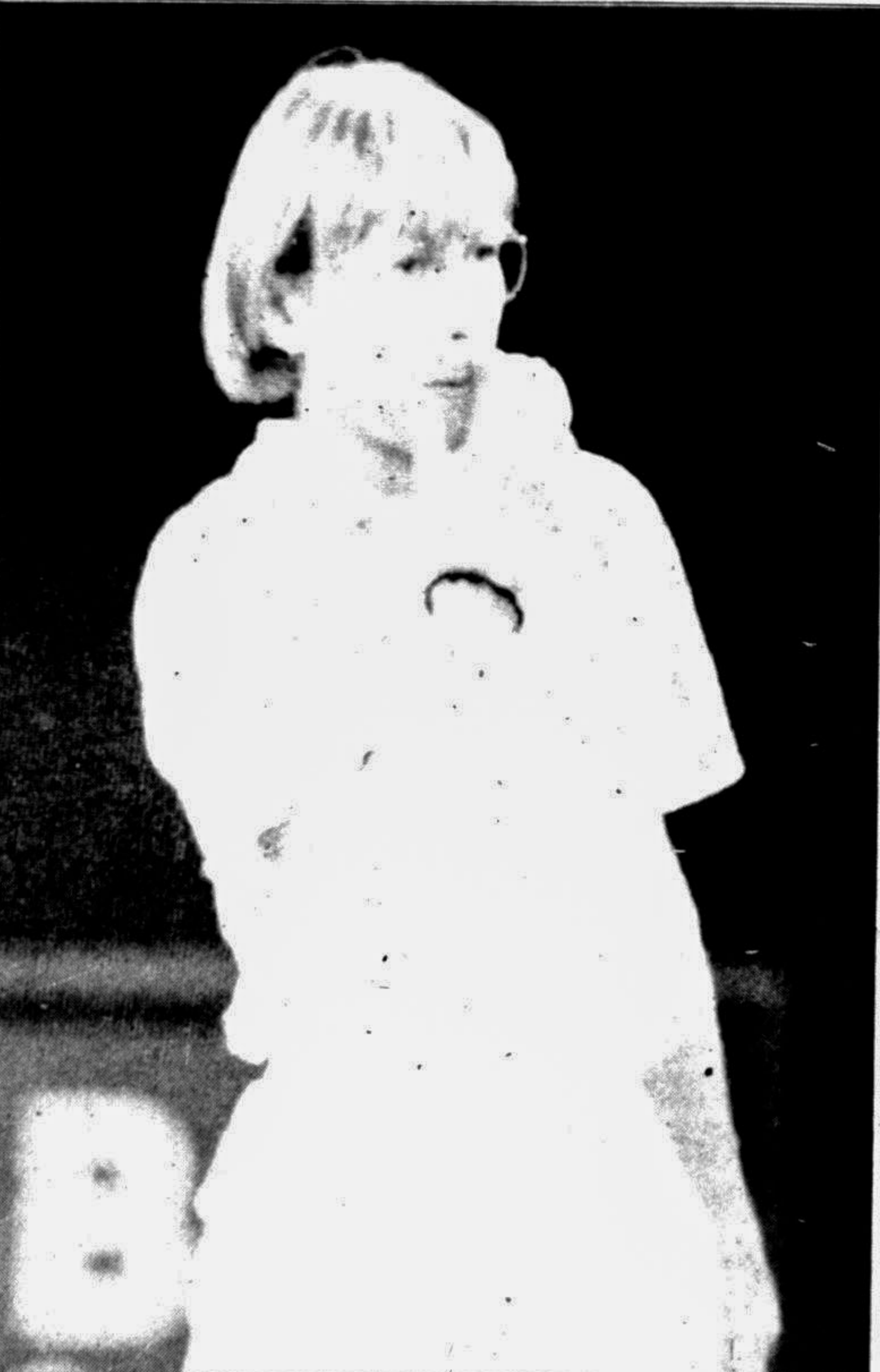
IN A FIX: Martina Navratilova, the evergreen naturalised American tennis player appears to be out of her depths against Natalia Zvereva of Belarus. The former regina in women's tennis never recovered to lose her quarterfinal tie in the Filderstadt Grand Prix tourney 3-6, 6-7 at Filderstadt, Germany on October 15.

Before the sending off, Iraq's domination had been complete. North Korea showed none of the style that saw their predecessors go further than any Asian nation at the World Cup finals when they reached the quarter finals in 1966 in England.