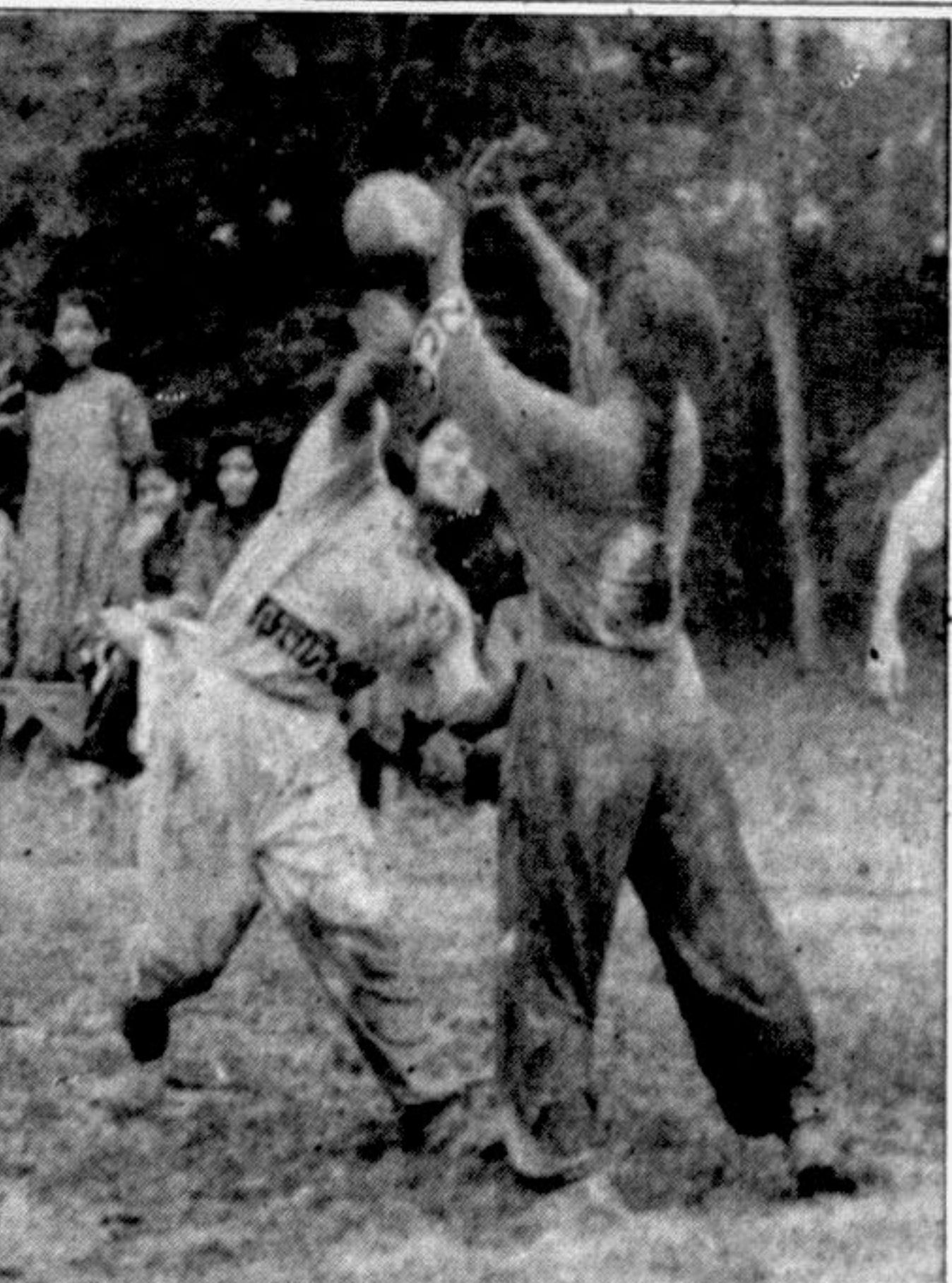
Action from the first Delta Life inter-college and hall handball competition match between Viquarunnisa Noon School and College and Rokeya Hall of Dhaka University at the Dhanmondi Women's Sports Complex yesterday. Viquarunnisa won the match 8-2.

Forwards: Gabriel Batistuta, Abel Balbo, Ramon Ismael.