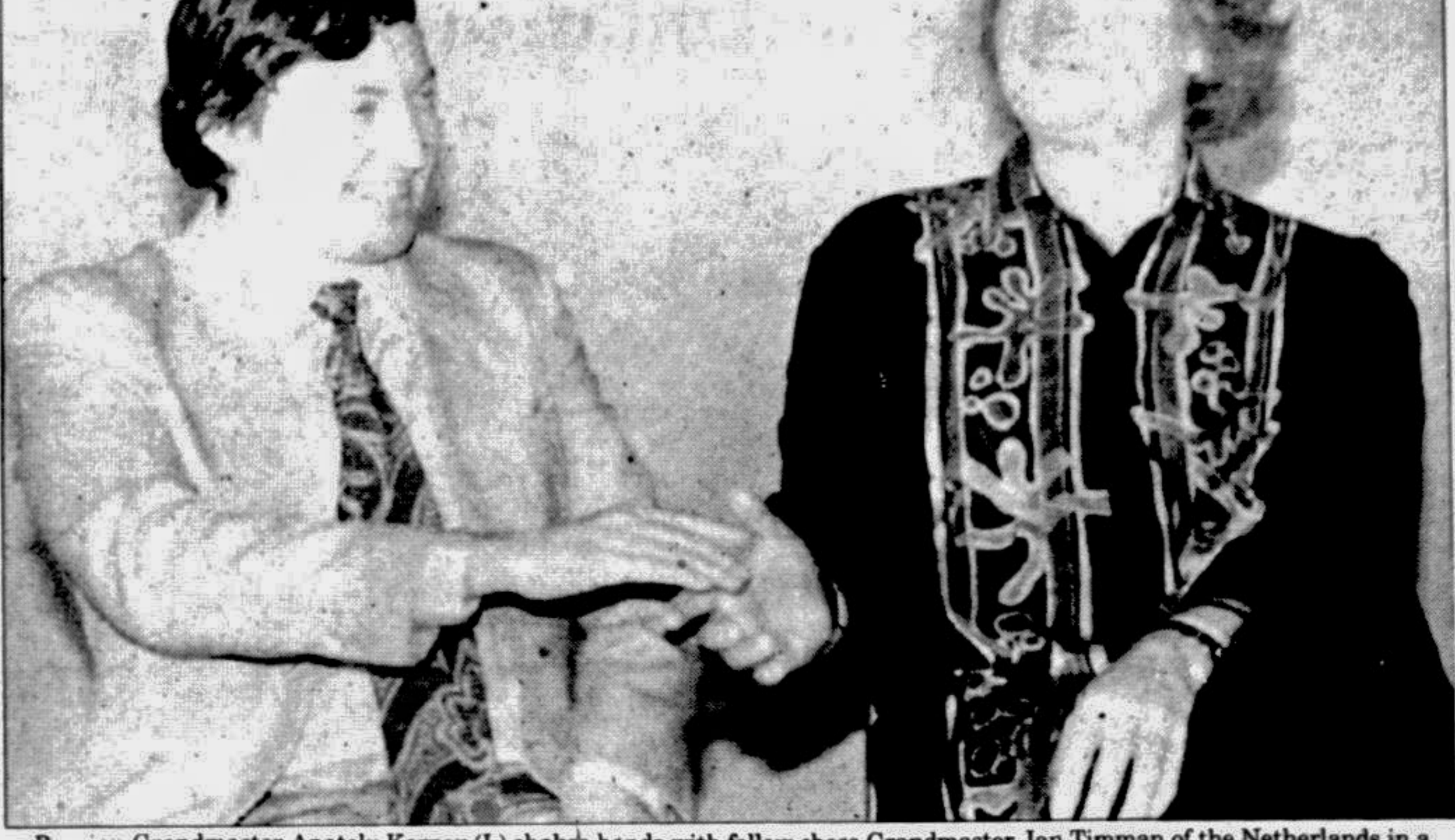
Russian Grandmaster Anatoly Karpov (L) shakes hands with fellow chess Grandmaster Jan Timman of the Netherlands in a joint press conference in Jakarta yesterday. Karpov arrived there on Oct 14. They will start playing the second half of their competition for the world title, organised by the FIDE, from Oct 17 to Nov 7.