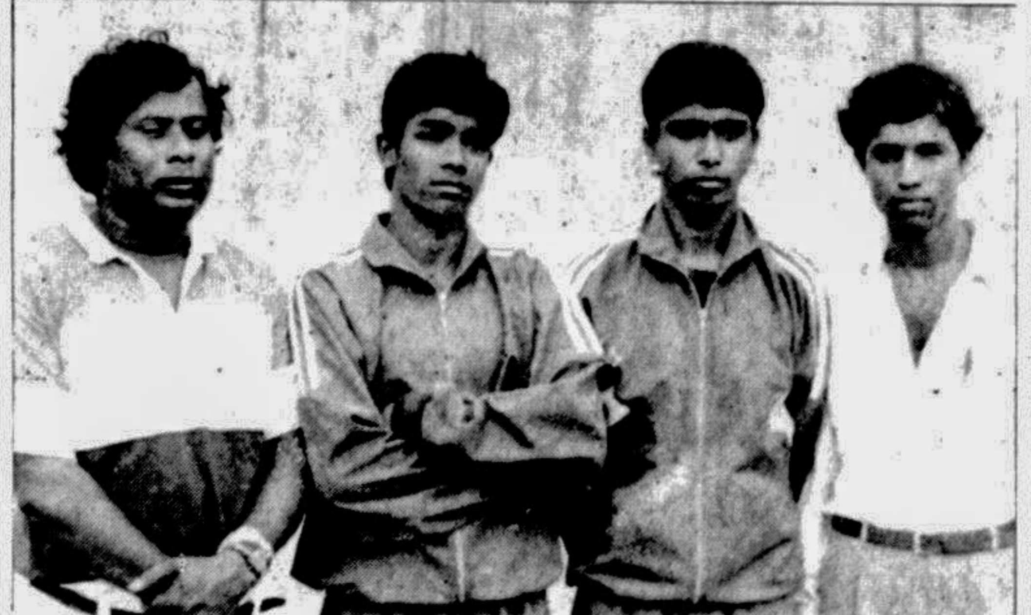
Natants and officials of the Madaripur DSA, who became champions bagging seven golds, in the two-day long second national youth swimming championship.

A victory of Pioline in the Bolzano tournament, which awards a top prize of $15,000, would lift the Frenchman among the top ten players in the ATP lists.