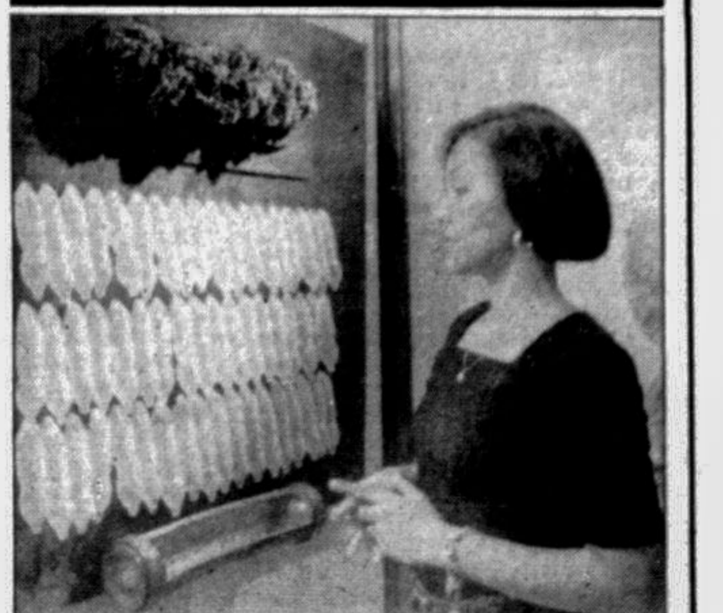
A woman views an artist's work entitled "Please be careful" made from 54 condoms at the Art Manila '93 exhibition on Friday which takes up the issue of AIDS.