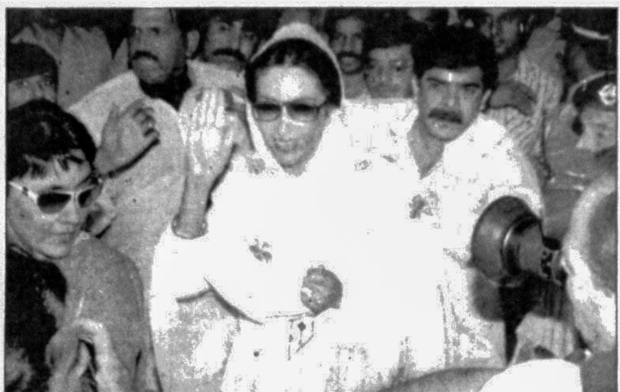
Benazir Bhutto, co-chairperson of the Pakistan People's Party (PPP) with her party supporters at the Karachi airport yesterday.

ISLAMABAD, Oct 11: Benazir Bhutto and her rival ex-premier Nawaz Sharif accused each other today of buying deputies in their tussle to form a coalition government in Pakistan's hung parliament, reports Reuter. "I think we have the centre sewn up," said a spokesman for Bhutto, whose Pakistan People's Party (PPP) victory in two of four crucial provincial elections on Saturday virtually assured her of the regional support she needs to recapture the post of Prime Minister. However, as the two leaders held frenetic meetings with potential allies, Bhutto raised fears Sharif was using the wealth of his family's industrial conglomerate to buy over independent deputies. "We have asked the caretaker Prime Minister to take strict notice of the fact that Nawaz Sharif is going around with bags of money trying to buy over independent candidates," Bhutto told reporters in Islamabad. She said Page 12 Col 1