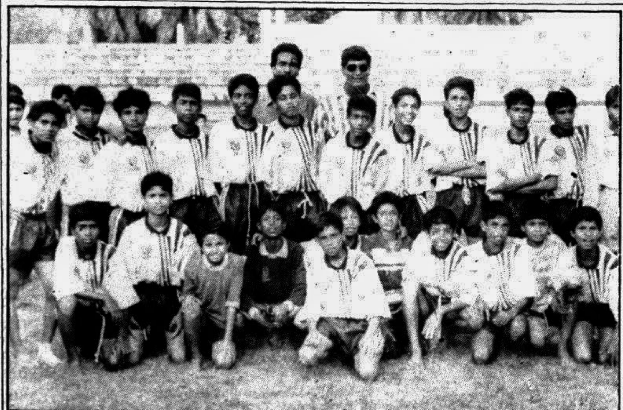
Players and officials of the Rokanpur Youth Club after winning the Shah Sports Cup juvenile soccer tournament yesterday at the Outer Stadium.

However, the league is looking forward to getting its own report, commissioned with an independent firm of auditors, which will take the cost of the club's recent transfers and turmoil into account.