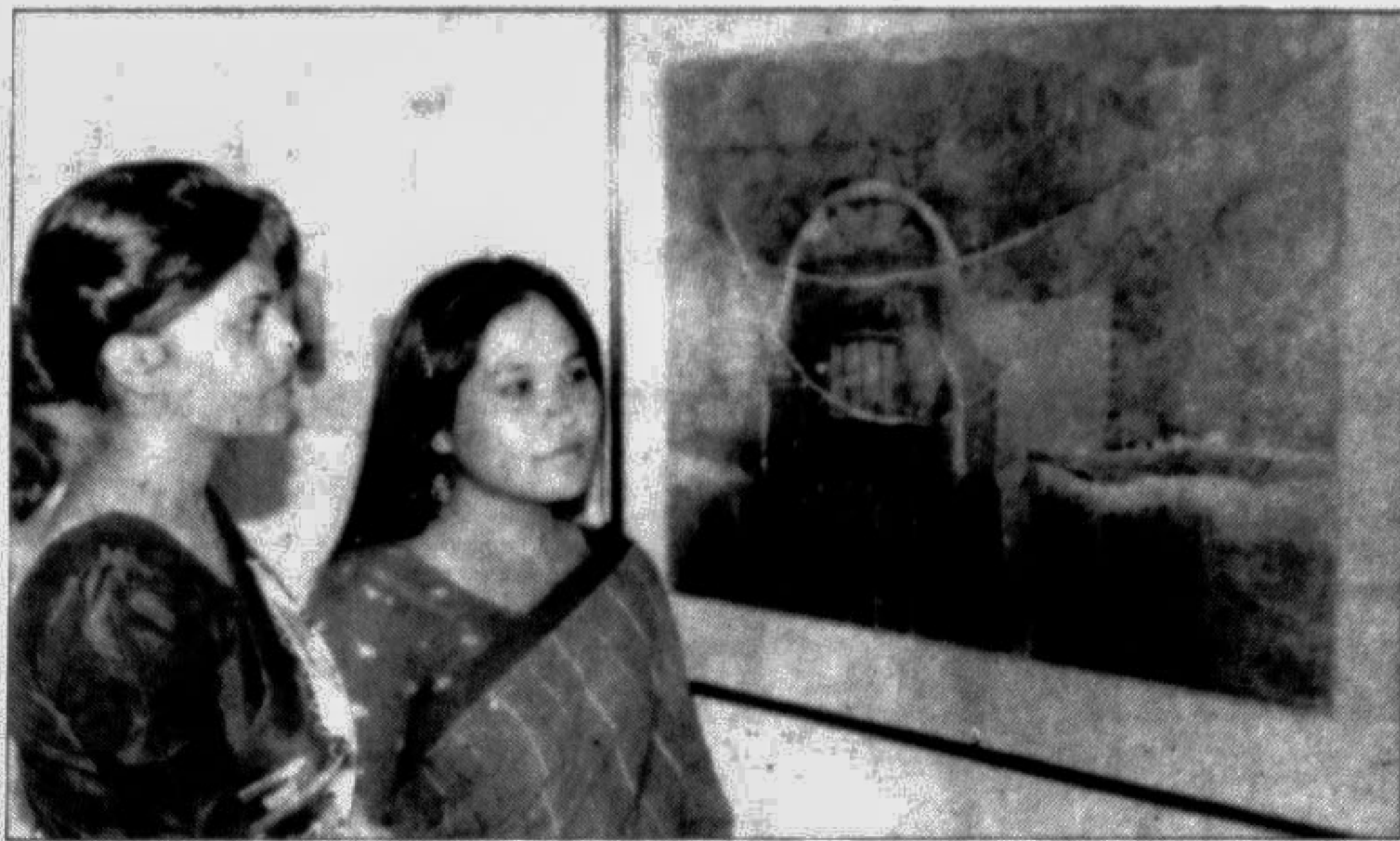
A solo painting exhibition of Nasreen Begum was inaugurated at the Gallery Tone in the city yesterday.