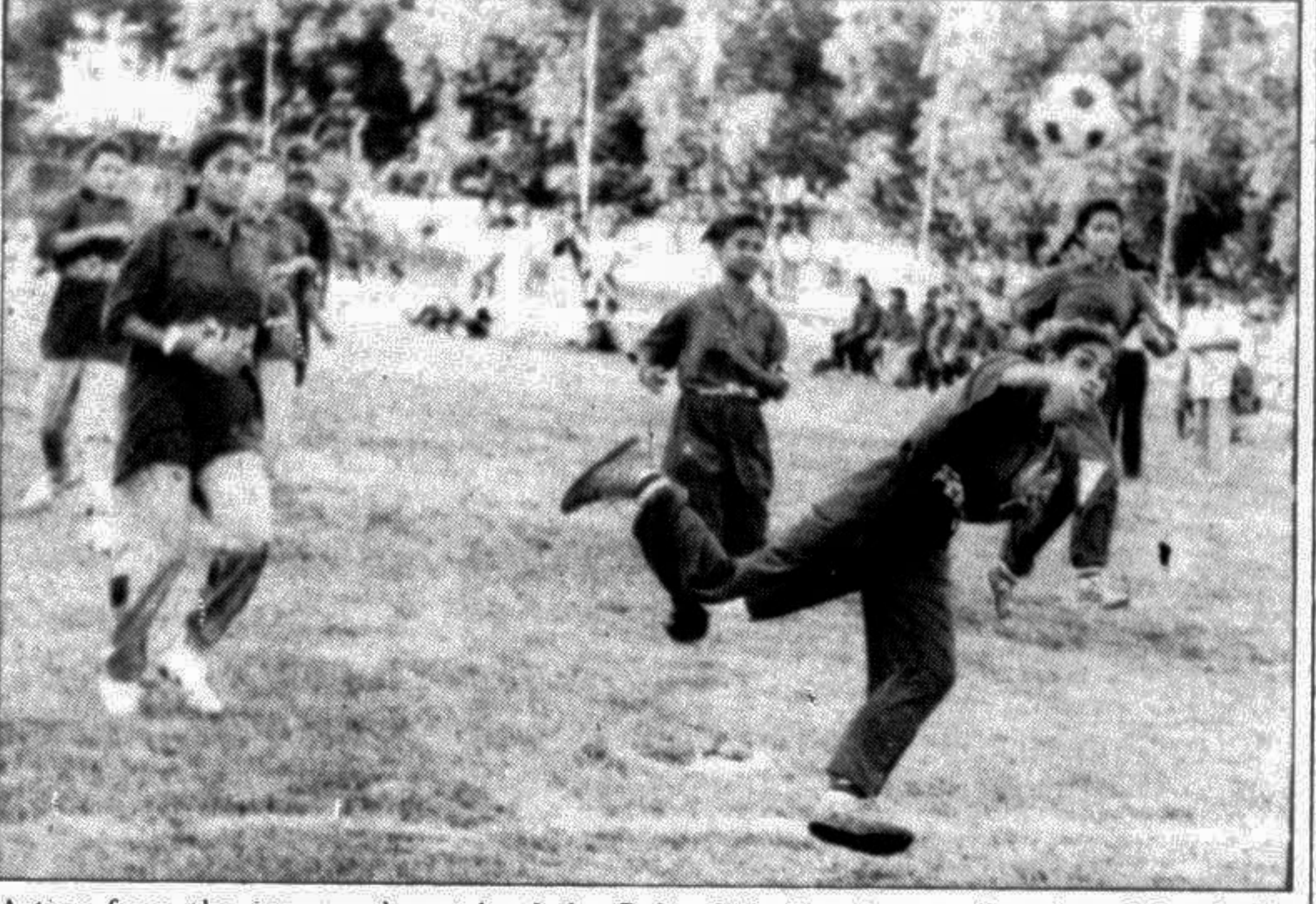
Action from the inaugural match of the Delta Life first inter college-hostel handball championship between Viquarunnisa Noon School and Holy Cross at the Dhanmondi Women's Sports Complex yesterday.

Sports Reporter The Bangladesh Cricket Control Board (BCCB) XI started their second prep trip to India with a depressing five-wicket defeat against ACA President's Eleven at Visha-kapatnam yesterday, according to a faxed message received here in Dhaka last night.