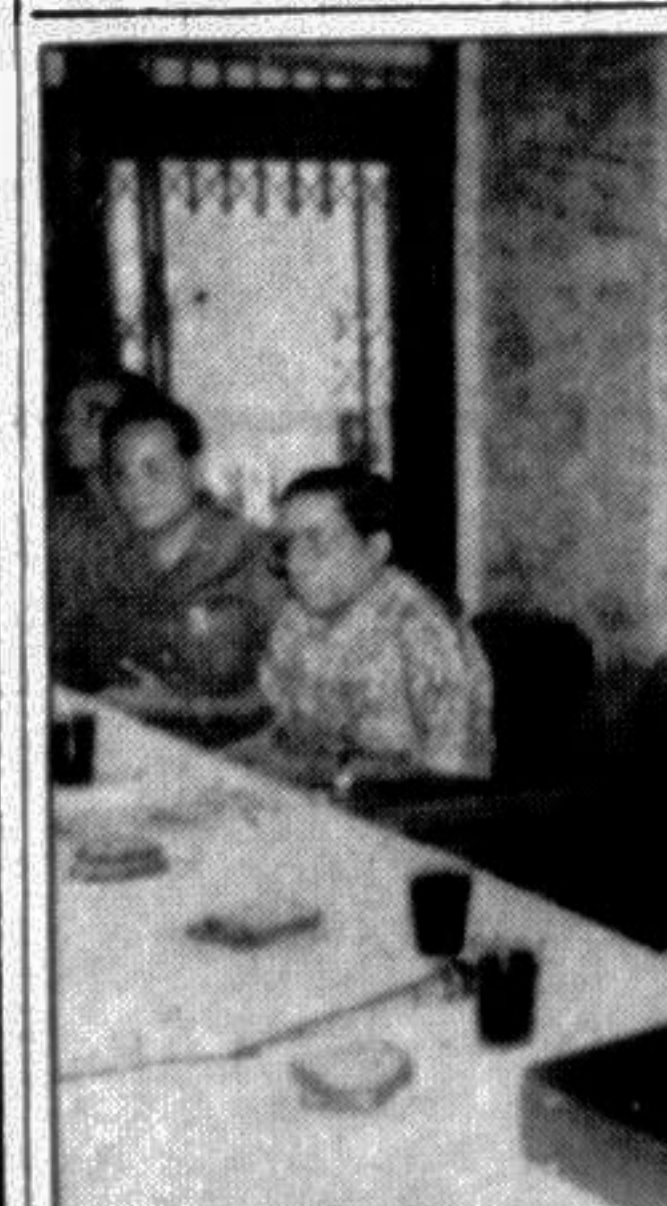
State Minister for Textiles Major (Retd) Abdul Mannan addressing the blood donation programme of the employees of the Eastern Insurance Company Ltd. at a function held at the company's office in the city yesterday.

In London, the British pound was quoted at 1.7260 dollar down from 1.5265 dollar late Wednesday.