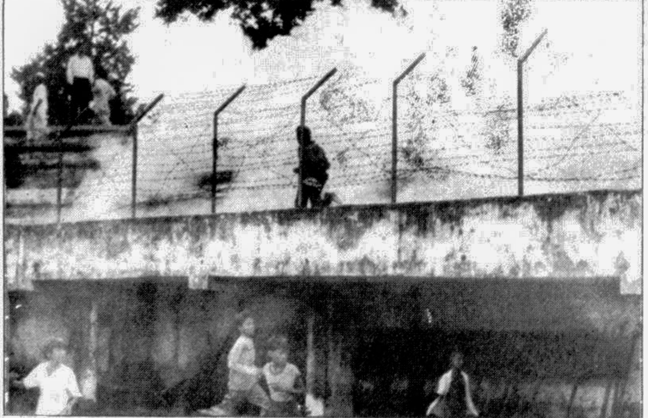
Smoke screen in the galleries of the Hockey Stadium after police resorted to teargassing to disperse the unruly rival supporters when they engaged in a skirmish during the crucial and final match of the Star First Division football league between Bangladesh Boys Club and East End Club yesterday.

South Korea hosted the 1988 Summer Olympics.