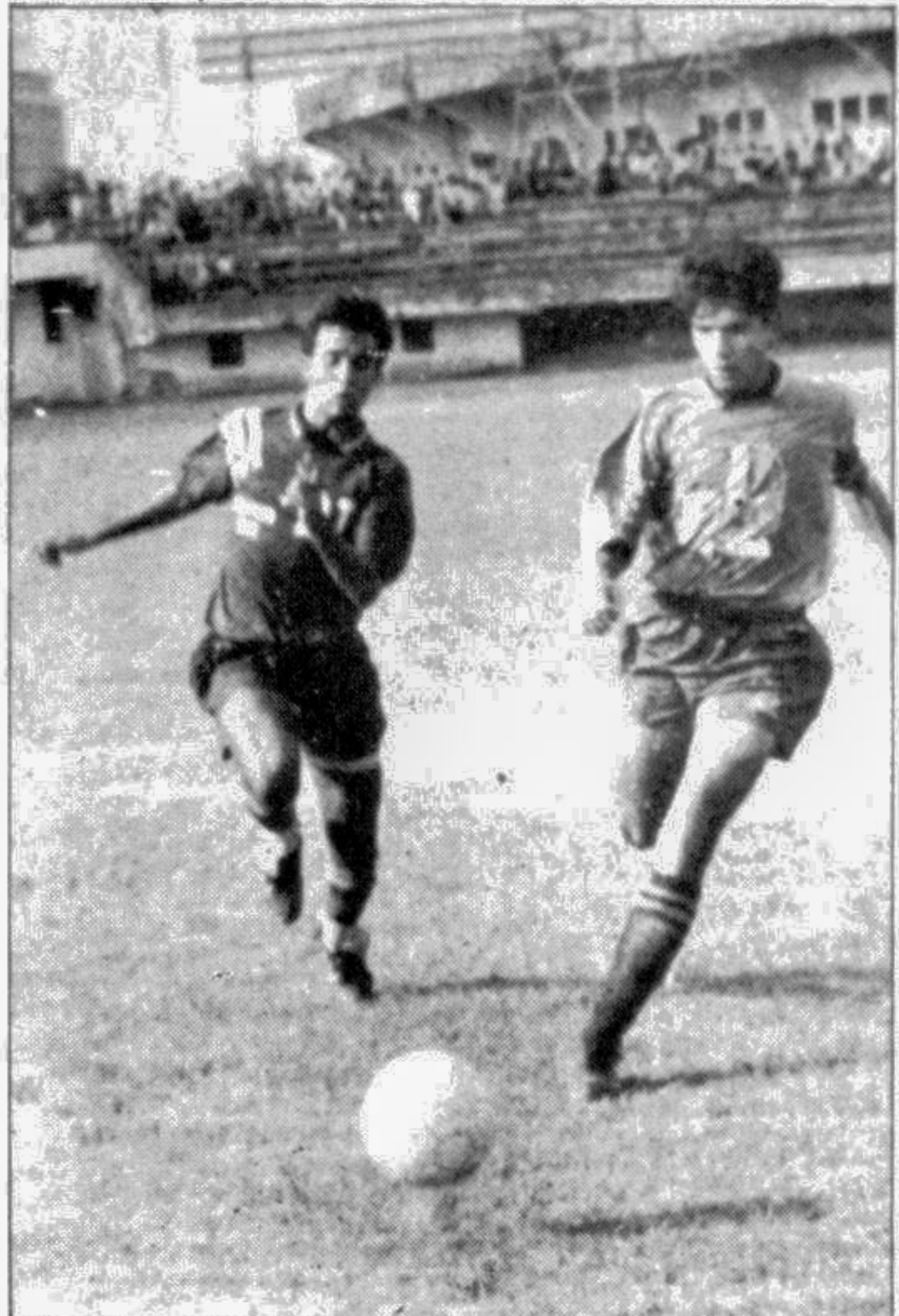
Action from yesterday's Star First Division football league match between Bangladesh Boys Club and East End Club at the Hockey Stadium.