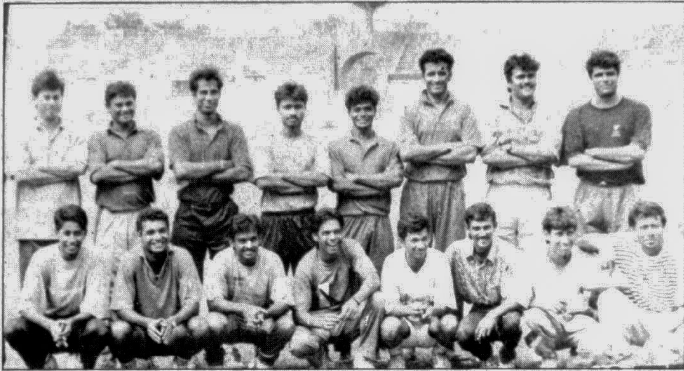
Players of the 19-member Bangladesh Cricket Control Board (BCCB) squad, scheduled to leave Dhaka today for India to play a number of friendly matches as a part of prep campaign for the ICC trophy to be held in Kenya early next year.