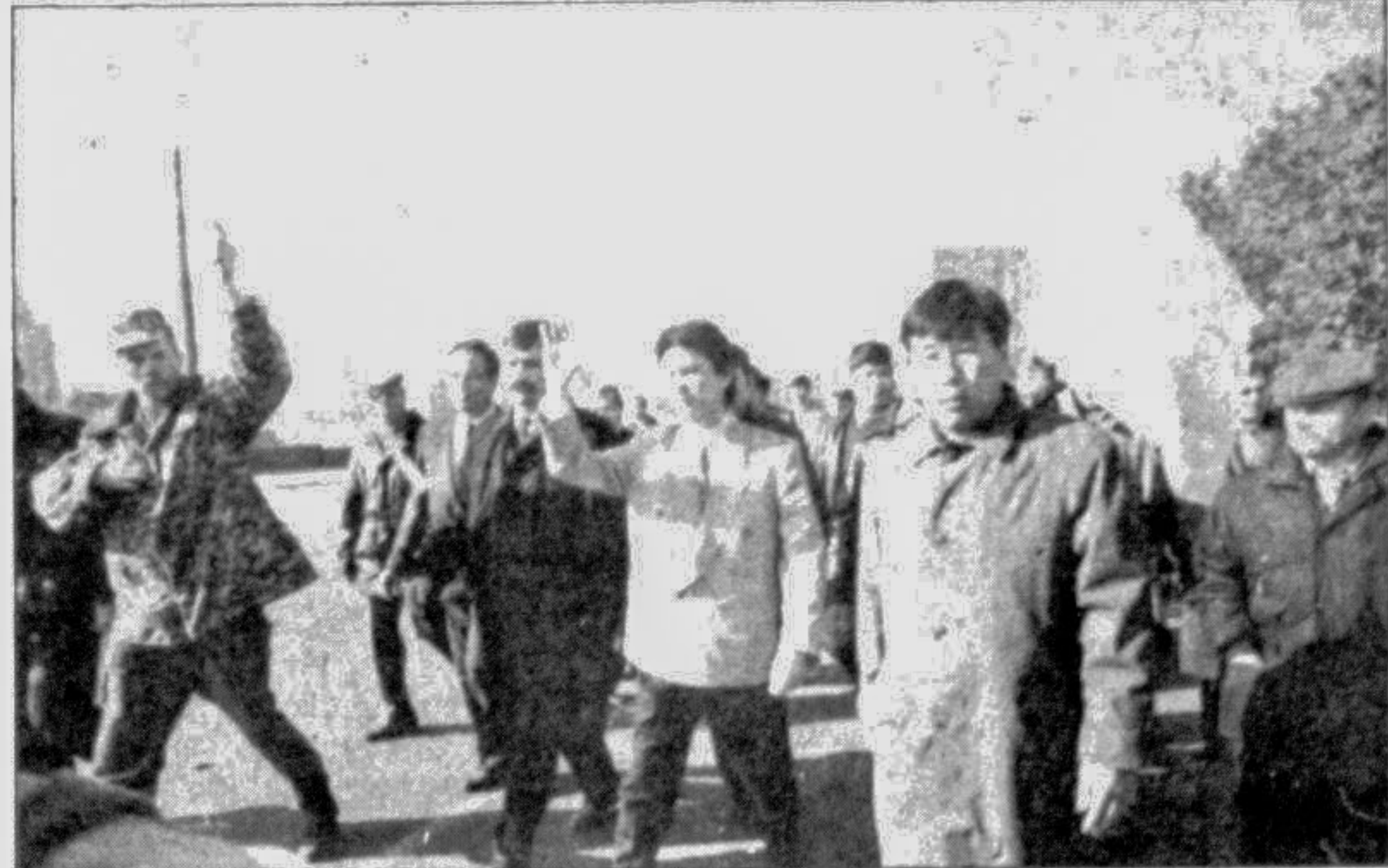
Dissenting People's Deputies, carrying white flags, walking out of the Parliament building in Moscow yesterday. President of the southern Russian republic of Kolmikiya, Kirsan Ilyumdjinov is seen waving his hand in the centre. — AFP photo

Witnesses saw dozens of bodies in and around the Parliament building. — AFP photo