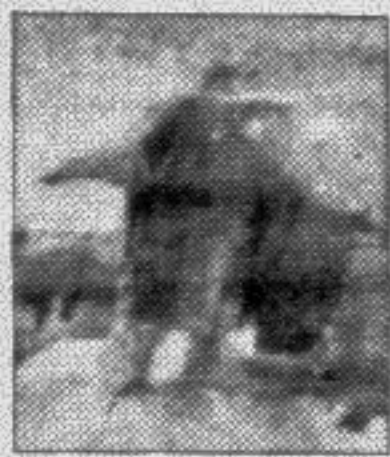
Soothing Scenes from Nature Page 3